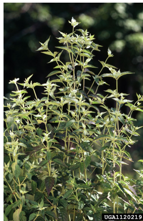
Pycnanthemum incanum, hoary mountainmint.

The essential oil content of Pycnanthemum varies by species and ranges from the pleasant floral and mint to pulegone, the