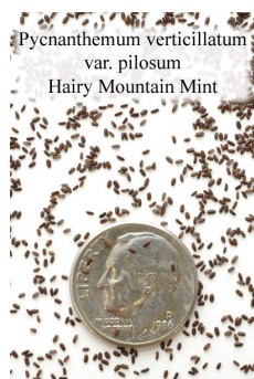
Seed size. Prairie Moon Nursery

Propagation of mountain mint is primarily done by seed and division. It is difficult to propagate stem cuttings as the shoots quickly develop into woody stems. However the emerging herbaceous stems can be propagated as cuttings. (Peter Borchard, Companion Plants, personal communication, February, 2015). Mountain mint is easily divided in late spring into summer and the divisions can be quite small and still survive. It can self-seed in the garden, but seedlings are easily identified by their fragrance and can be removed if they are overabundant or in the wrong place.