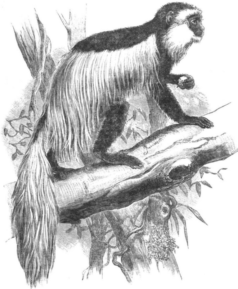
FIG. 4.— Colobus guereza , var. caudatus .