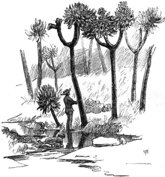
FIG. 2.— Senecio Johnstoni .

But of all the scientific papers by far the most important are the two chapters contributed by Mr. Johnston himself on the anthropology and philology of the Kilima-Njaro district, or rather of all the East Central African region lying between the great lakes and the Indian Ocean. Measured by a pecuniary standard, it is not too much to say that these two monographs alone are fully worth the 1000 l. granted by the British Association and Royal Society for the purposes of the expedition. Besides a graphic account of the Bantu and Masai peoples, whose respective domains are conterminous, or overlap each other in this part of the continent, we have here a general disquisition on their mutual ethnical and linguistic