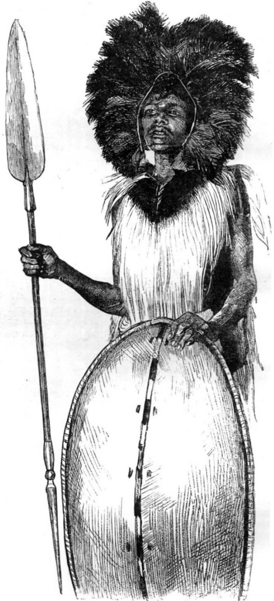
FIG. 3.—A Masai Warrior.