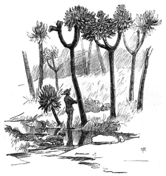
Fig. 2. - Senecio Johnstoni.

T. depressa, Krauss. But of all the scientific papers by far the most important are the two chapters contributed by Mr. Johnston himself on the anthropology and philology of the Kilima-Njaro district, or rather of all the East Central African region lying between the great lakes and the Indian Ocean. Measured by a pecuniary standard, it is not too much to say that these two monographs alone are fully worth the 1000l, granted by the British Association and Royal Society for the purposes of the expedition. Besides a graphic account of the Bantu and Masai peoples, whose respective domains are conterminous, or overlap each other in this part of the continent, we have here a general disquisition on their mutual ethnical and linguistic