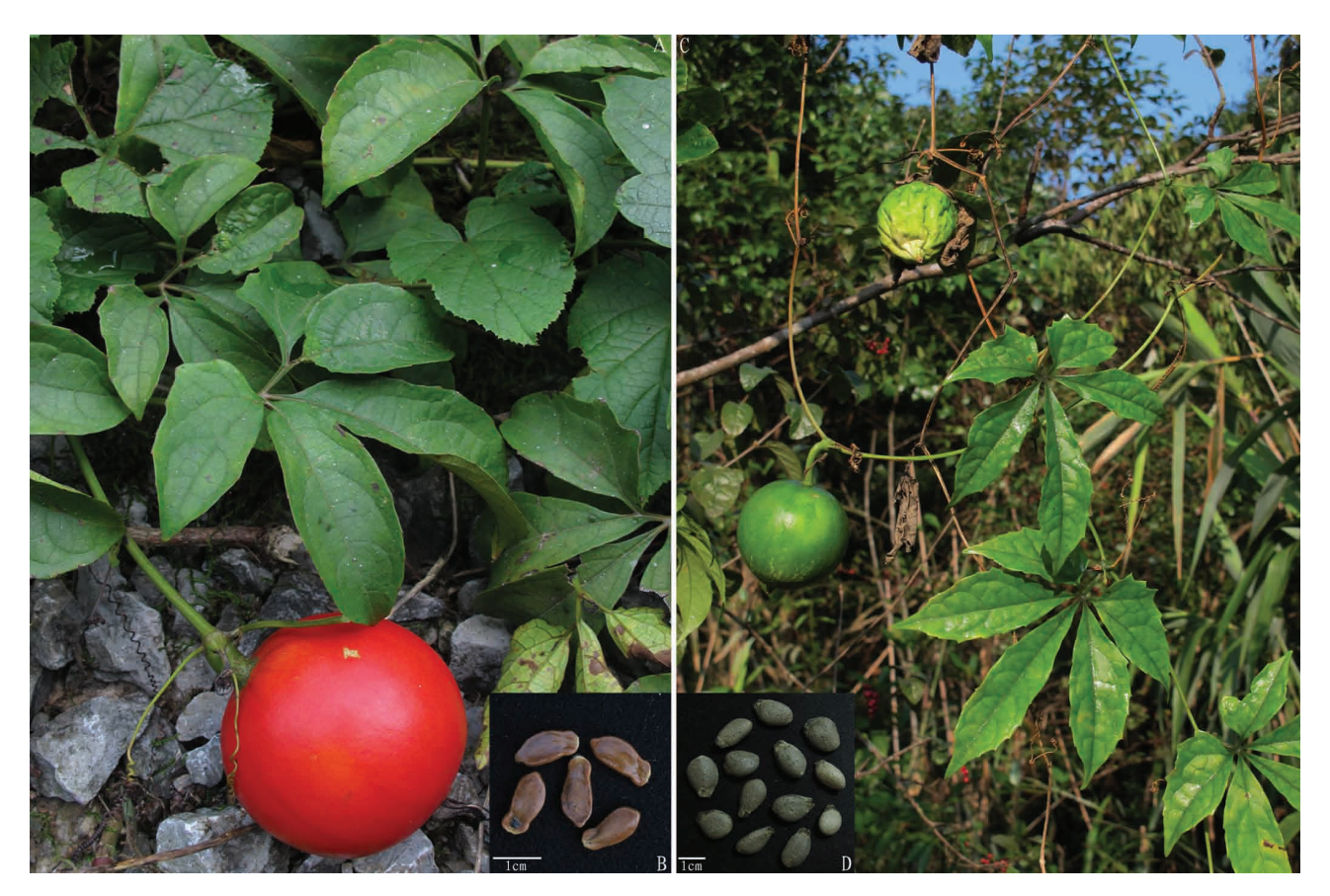
FIGURE 2. Trichosanthes napoiensis sp. nov. A. Habit. B.Seeds; Trichosanthes pedata C. Habit. D. Seeds.