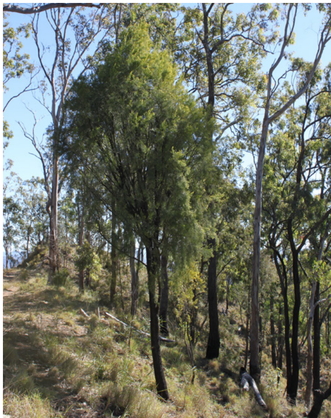
Native Cherry ( Exocarpos cupressiformis ).