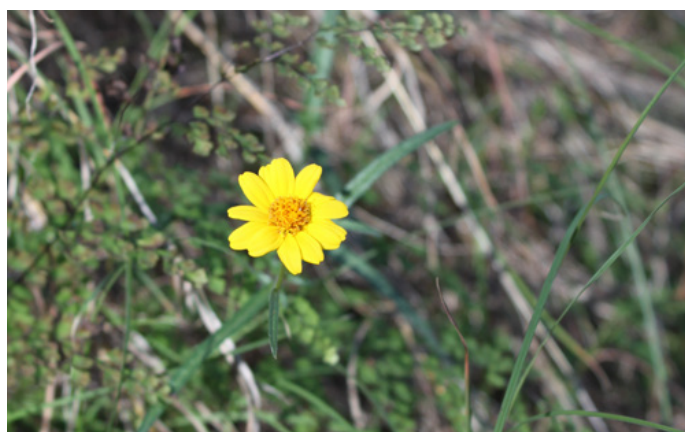
Acmella ( Acmella grandiflora var brachyglossa ).