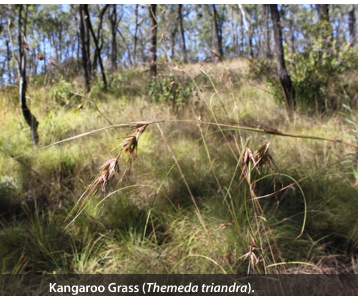
Kangaroo Grass ( Themeda triandra ).