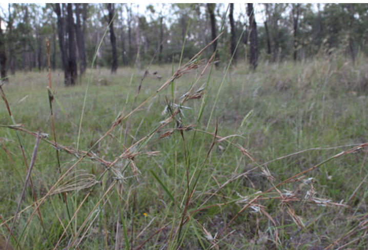
Barbed Wire Grass ( Cymbopogon refractus ).