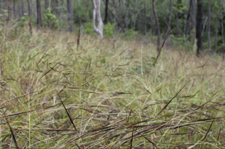
Black Spear Grass ( Heteropogon contortus ).