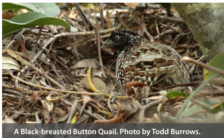
A Black-breasted Button Quail.

A number of rare and threatened plants and animals live in the Hoop Pine scrubs of SEQ, for example the Black-breasted Button Quail is a sedentary ground-dwelling bird that has suffered a major population decline due to clearing and fragmentation of its habitat.