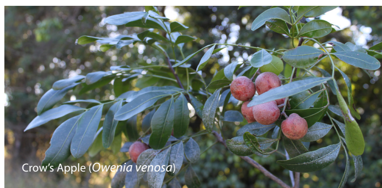
Crow's Apple ( Owenia venosa )

Designed and produced by Healthy Land & Water, a community based, not-for-profit organisation that works to protect and restore the natural resources of South East Queensland. Visit www.hlw.org.au