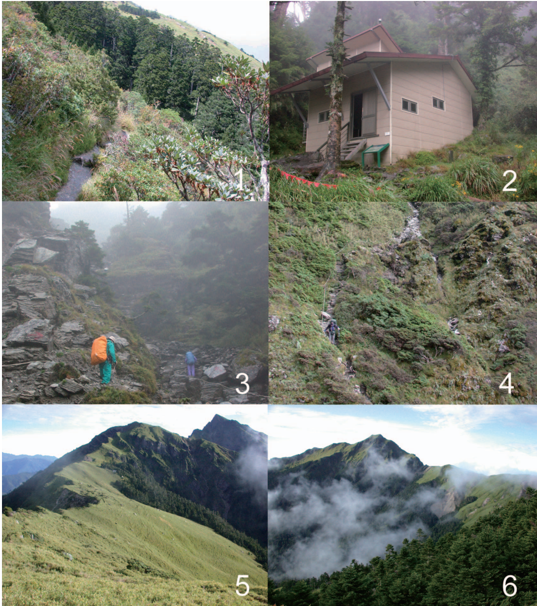
Fig. 2. Photographs showing the area investigated. 1. Abies kawakamii forest and grassland at the eastern slope between Song-Syue Hotel and Chenggong Cabin. 2. Chenggong Cabin. 3. Lower part of the western slope between Chenggong Cabin and the ridge. 4. Upper part of the western slope between Chenggong Cabin and the ridge. 5. North Peak of Mt. Chilai with Chilai Cabin just under the ridge. 6. Main Peak of Mt. Chilai.

studied in Mt. Chilai was narrower than that of Mt. Yushan in size and elevation (2800–3560 m in Mt. Chilai, 2600–3952 m in Mt. Yushan). The moss floras of both mountains are somewhat different in their species composition. The