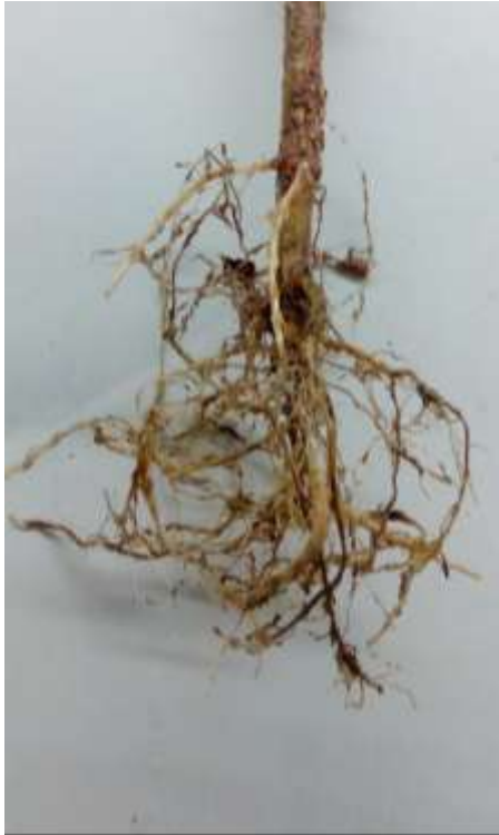
Figure 1: Morphological features of Root of Eranthemum nigrum