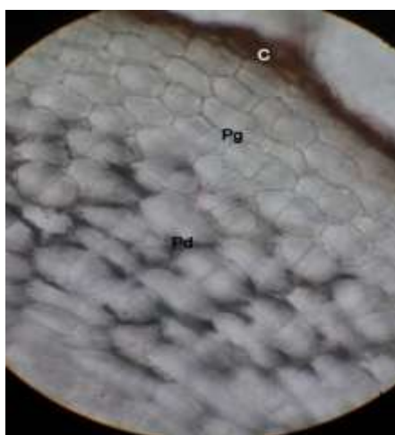
Figure 5: T.S section of Eranthemum nigrum root showed cork region. C: Cork; Pg: Phellogen; Pd: Phelloderm