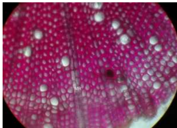
Figure 3: T.S of Eranthemum nigrum root showed Medullary rays and Xylem Vessels. MR: Medullary rays; XV: Xylem vessels.