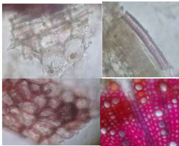
Figure 8: Powder Microscopy of Root of Eranthemum nigrum (a) Parenchyma cells (b) lignified xylem vessels (c) Cork cells (d) Medullary rays with xylem vessels

The crude powder of root was buff in color with characteristic odor and taste. The microscopic study of the powder showed revealed different characters such as diacritic stomata, covering trichomes, xylem vessels, and parenchyma cells (Figure 8).