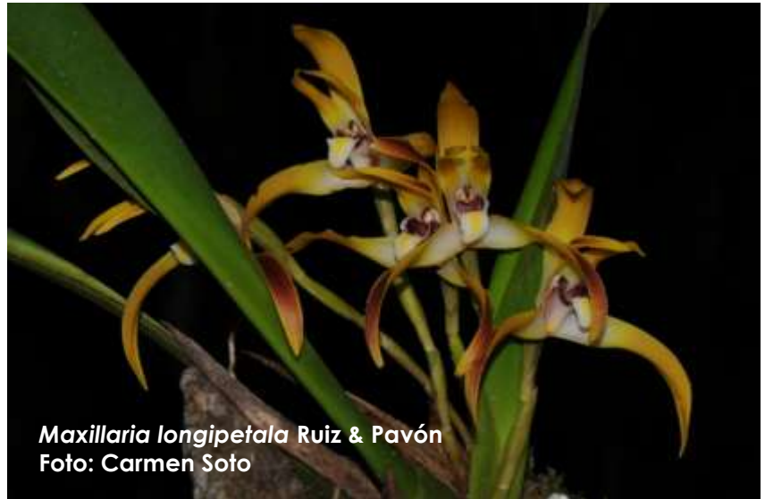
Maxillaria longipetala Ruiz & Pavón

Trichoceros antennifer (Humboldt & Bonpland) Kunth N. R.