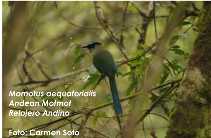
Momotus aequatorialis Andean Motmot Relojero Andino

From the 1st to the 30th of November, between 6:00a.m, and 18:00 p.m. and Andean motmot ( Momotus aequatorialis ) was observed at the following locations around Inkaterra Machu Picchu Pueblo Hotel: orchid trails, reception building, lobby, main dining room, room blocks from 20 to 90, sacred rock, camping area, tea house and Andean bear rescue centre. This bird belongs to the Momotidae family and has a characteristic tail that has a racket shape that swings like a pendulum.