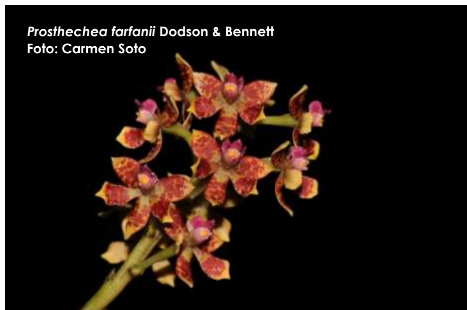
Prosthechea farfanii Dodson & Bennett