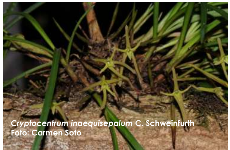
Cryptocentrum inaequisepalum C. Schweinfurth