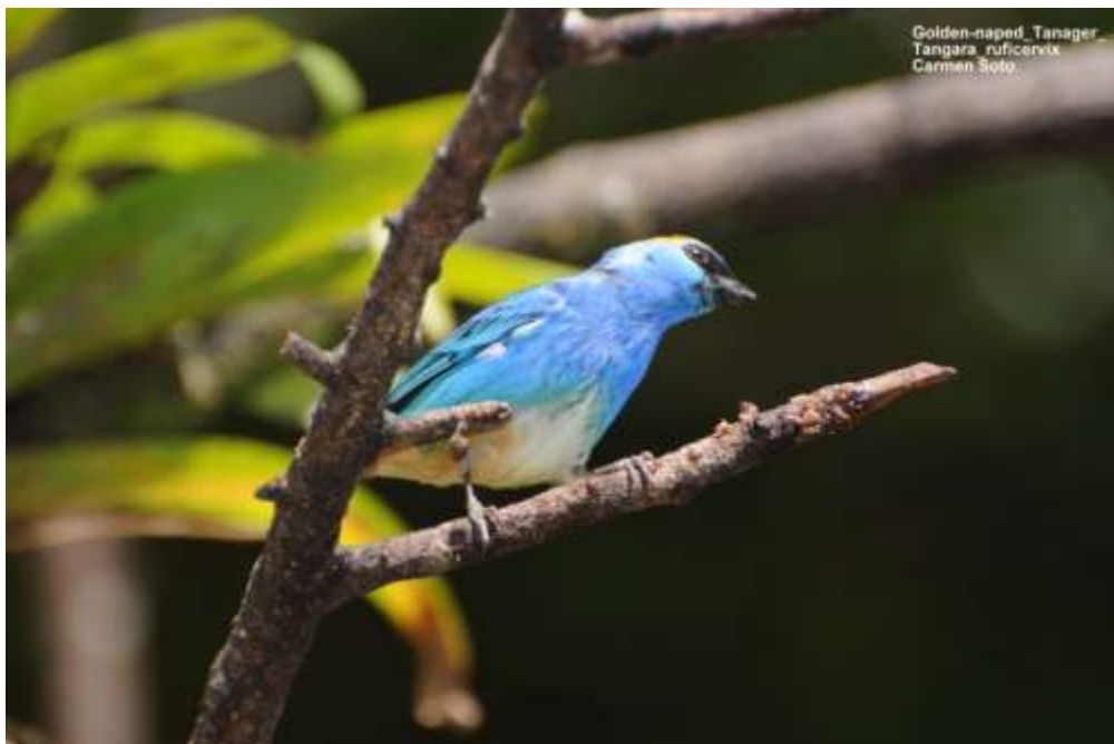
Golden-naped Tanager Tangara ruficervix

Boissonneaua matthewsii Colibrí coruscans Colibri thalassinus Chaetocercus mulsant Amazilia viridicauda Leucippus chionogaster Coeligena torquata Adelomyia melanogenys Ocreatus underwoodii Agelaiocercus kingi Coeligena coeligena