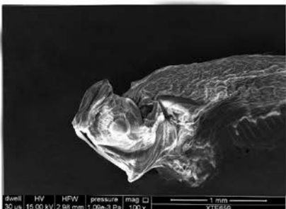
Fig. 7. SEM - Image of anterior portion of 22- days stage