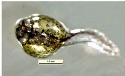
Fig. 3. Advanced hatchling