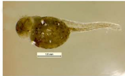
Fig. 4. Yolk sac - stage