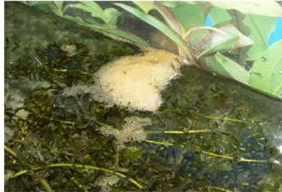
Fig. 1. Bubble nest