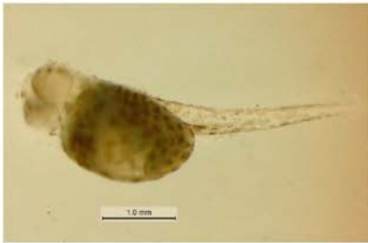
Fig. 5. 3 - days stage