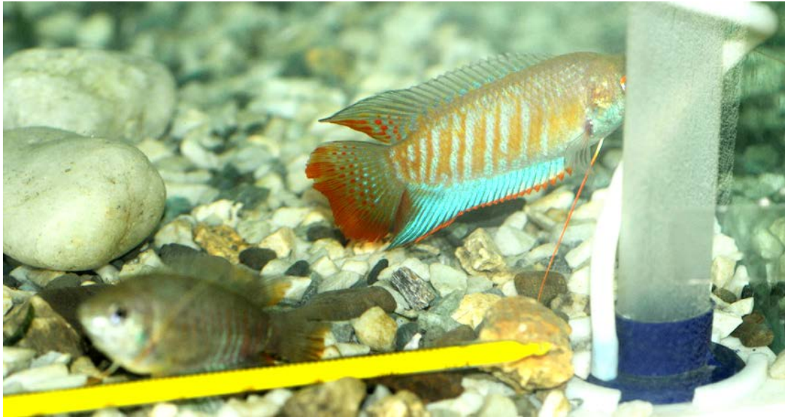
PLATE 1. Breeding of Trichogaster labiosa by increasing temperature of aquarium water