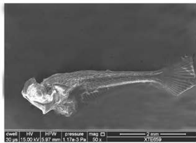
Fig. 8. SEM - Image of 22- days stage