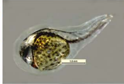
Fig. 2. Hatchling