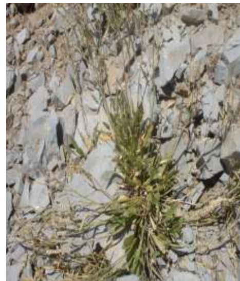
Figure 4: Achoriphragma kuramense