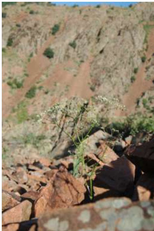
Figure 2: Kamelinia tianschanica