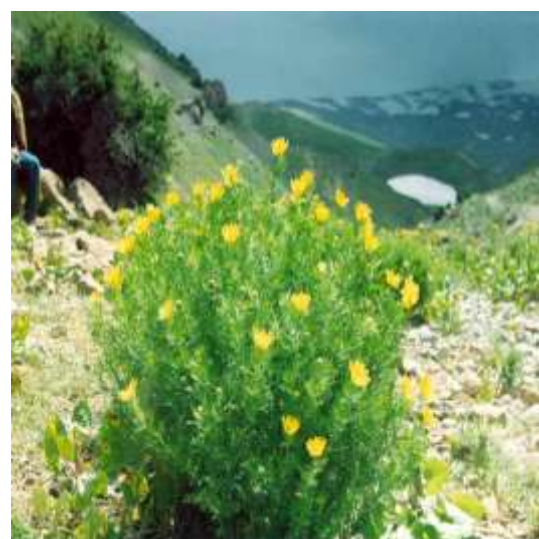
Figure 5: Adonis leiosepala