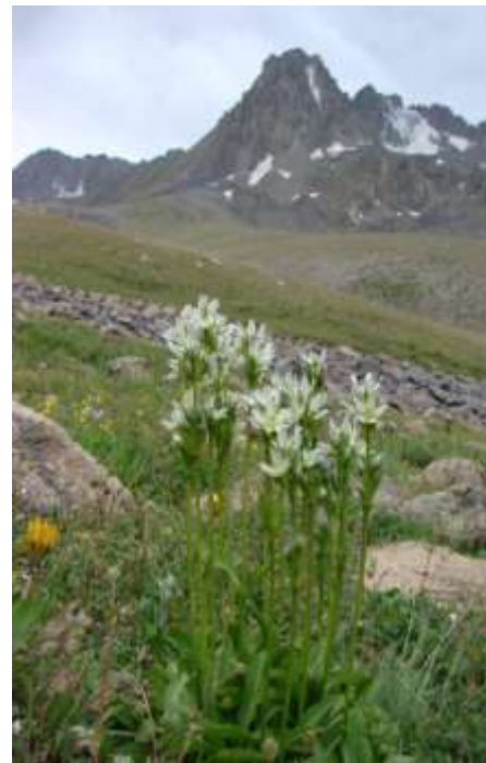
Figure 3: Swertia gonzaroviiana

Thus, endemism of the flora Akhangaran river basin is one of the original and has its own specific characteristics. Most of them are West Tien-Shan kinship, connecting the flora with more humid area of Western Tien-Shan. A small number of species is Pamir-Alay kinship. Narrow endemics of the Akhangaran river basin are little. They make up no more than 30% of the total number of rare species. The basic number of endemics is concentrated to the ancient Mediterranean in Allium , Astragalus , Cousinia , Gagea , Tulipa and others.