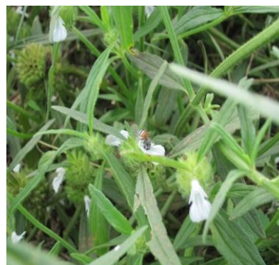
J. Apis florea collecting pollen sternotribically