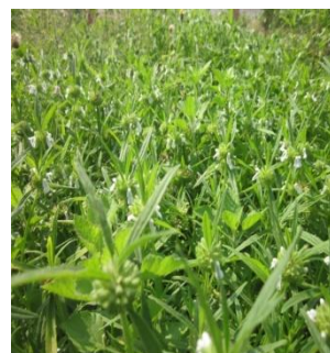
N. Flowering phenology of Leucas aspera