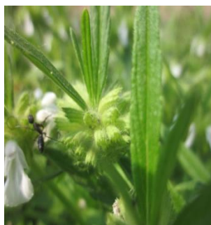
M. Camponotus sp. Moving round the flowers