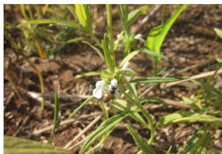
F. Apis florea collecting nectar nototribically