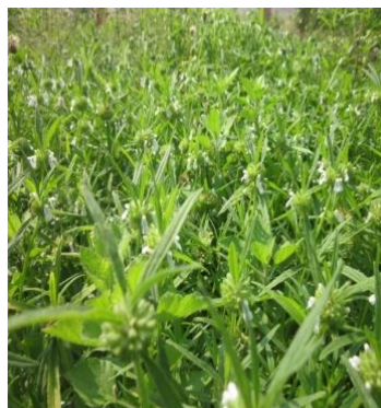
H. Flowering phenology of Leucas aspera