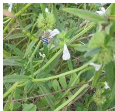
D. Amegilla sp. Porbing the flower nototribically for nectar