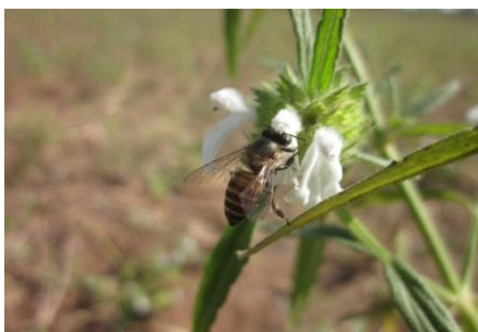
E. Apis cerana indica collecting nectar nototribically