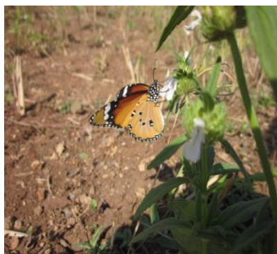
K. Danaus chrysippus probing the flower