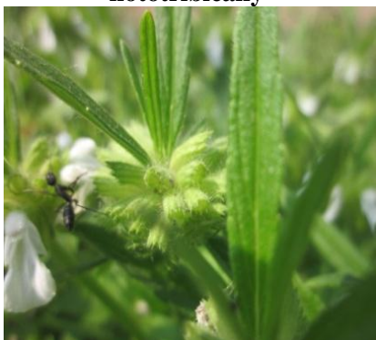
G. Camponotus sp. Moving round the flowers