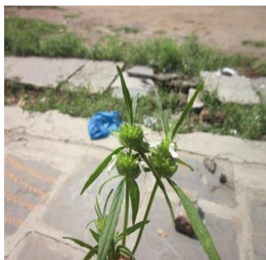
I. Leucas aspera – inflorescences (flowering verticells)