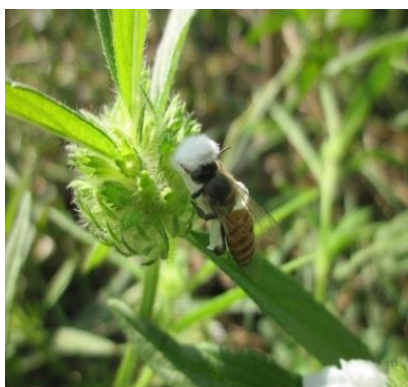
A. Apis dorsata collecting nectar