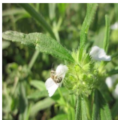
C. Junona almona sp. collecting the pollen sternotribically