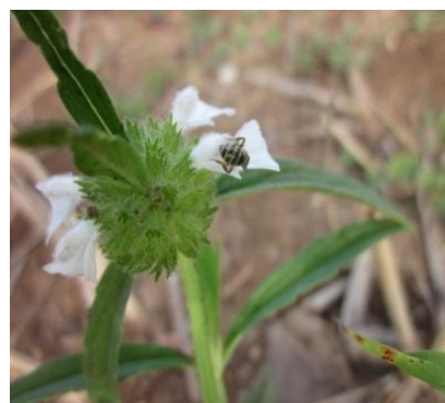
B. Anthophora sp. collecting the nectar nototribically