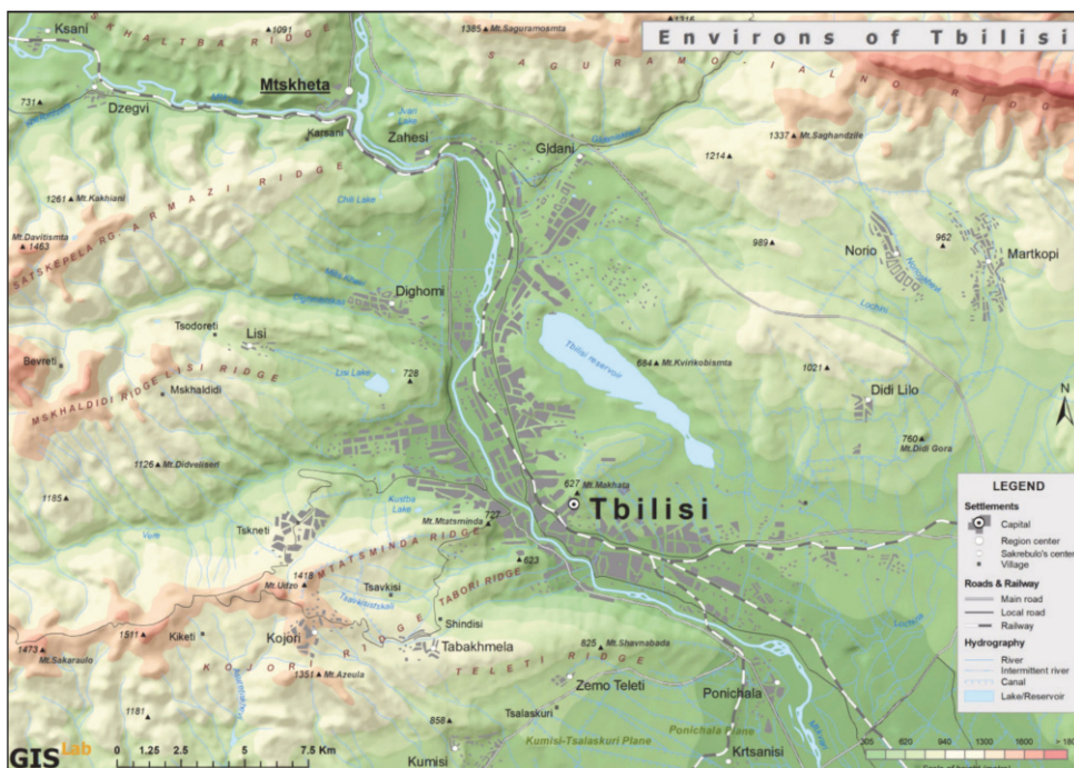
Fig. 1. Physical-geographic map of Tbilisi area.

Tbilisi area (Fig. 1) is located in the central part of South Caucasus. The territory covers part of Mtkvari River basin from vil. Dzegvi to the section between Ponichala and Rustavi. Endings of large geographical units of different origin and geological age are gathered in the area of Tbilisi, which greatly conditions complexity of the relief. In particular, Tbilisi area comprises the Saguramo-Ialno (Kukheti) Ridge, the eastern part (Skhaltba Ridge) of Kvernaki Ridge, the eastern endings of the Trialeti Ridge (Satskepela and Armazi, Mskhaldidi and Lisi, Mtatsminda, Narikala, Tabori, Kojori, Teleti ridges), the extreme end of the north-west and western parts of Iori plateau (Samgori, Vaziani, Tbilisi Sea and its vicinities), the extreme north-west end of the Mtkvari-Araxi lowland – Kvemo Kartli lowland, in particular, Ponichala and Kumisi-Tsalaskuri plains. Hypsometrical amplitude of Tbilisi area is about from 350 m a.s.l. to 1875 m a.s.l. (Maruashvili 1964; Kavrishvili 1964; Ukleba 1968, 1974; Tatashidze 2000).