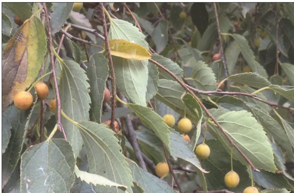
Fig. 3. Celtis australis subsp. caucasica in Tbilisi.