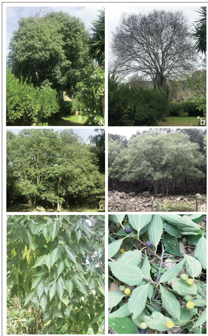
Fig. 1. a) Type tree of Celtis australis var. panormitana resumed in full vegetative activity; b) The same tree in winter version; c) Typical habitus of C. australis var. australis in Bosco di Caronia; d) Trees related to the new var. panormitana , present together with the typical form of the species in the same Bosco di Caronia; e) Detail of a branch showing the leaf shape of the new variety; f) Detail of the leaves and fruits of plants related to var. panormitana found in Bosco di Caronia.