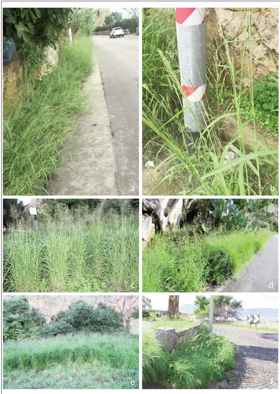
Fig. 3. a, b, c, e) Megathyrus maximus var. maximus in the various collection sites of Palermo; d, f) M. maximus var. pubiglumis in Monte Pellegrino (Palermo).