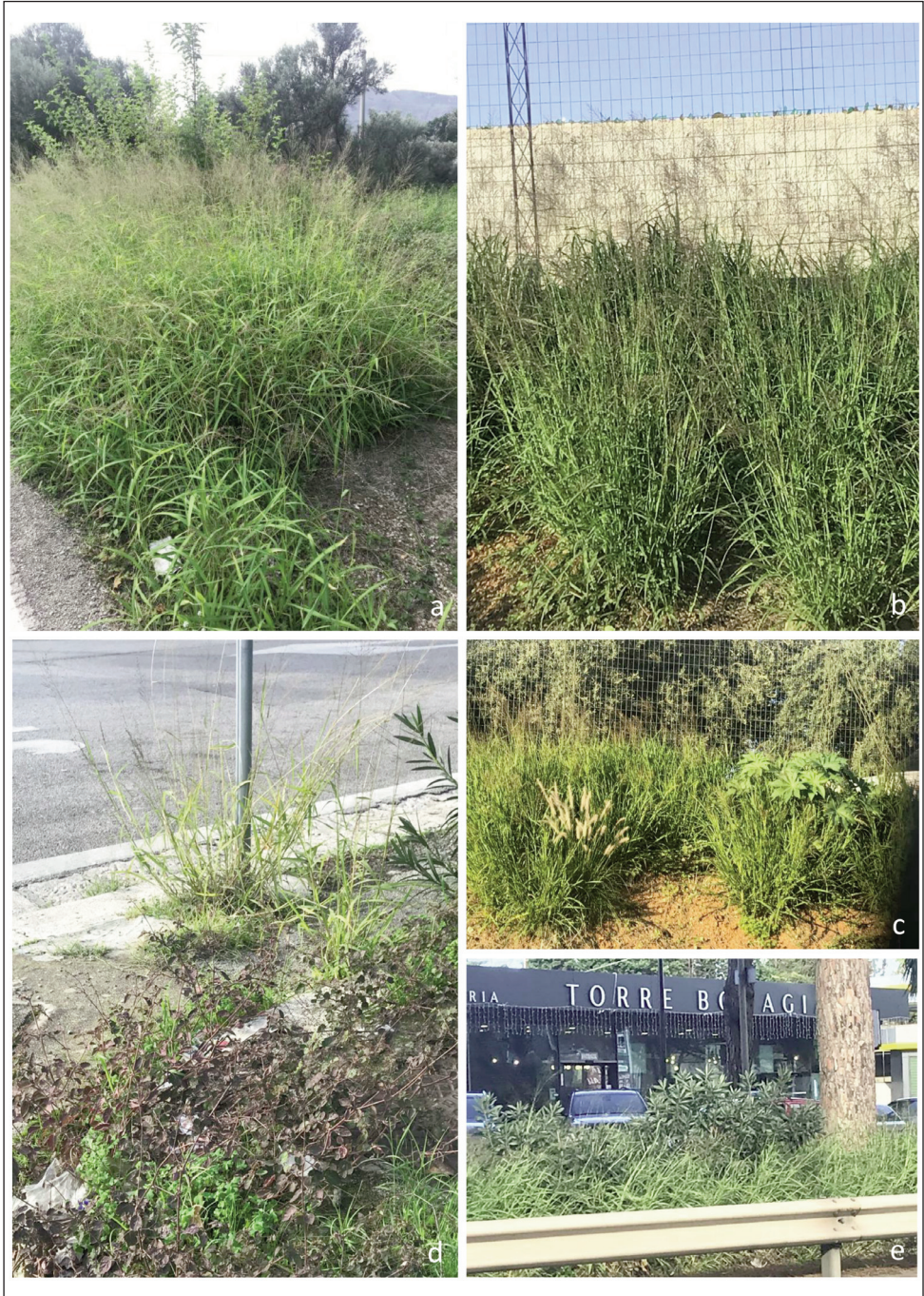
Fig. 2. Megathyrsus maximus var. maximus in the various collection sites from Capo d'Orlando (East) to Palermo (West).