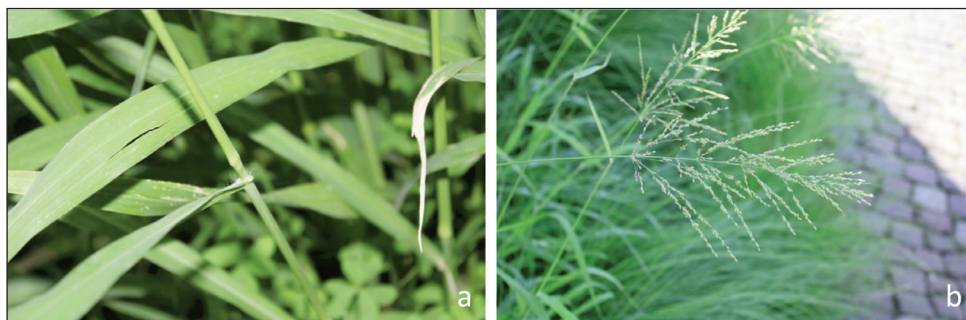
Fig. 4. Details of: a) Megathyrsus maximus var. maximus and b) M. maximus var. pubiglumis .