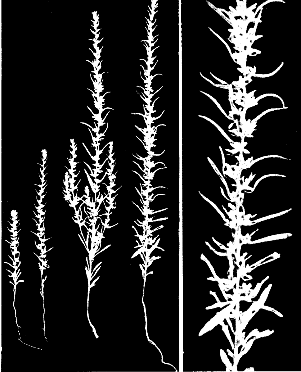
Fig. 4. Isotype specimen (SOA No. 45520) of Thymelaea bulgarica , sp. nova.

stamina (2-)4-6(-8); antherae 0.30-0.40 × 0.18-0.20 mm, flavae. Nucula 1.7-2.0 × 0.9-1.1 mm, pyriformis, nigra, nitida, in tubo perianthii persistente inclusa. – Fl. Jul.-Aug., fr. Aug.-Sep.