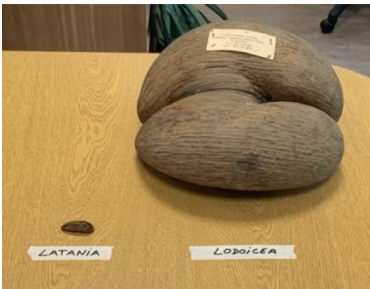
Lodoicea, the double coconut is the largest palm seed in the world. It's closest relative Latania has a seed surprisingly much smaller.