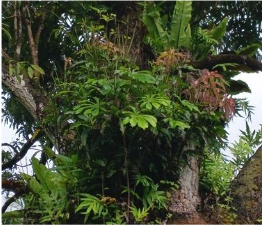
A young Cecropia in a mature mango tree

Even when found as small plants with only a few leaves, they can be difficult to extricate. Like banyan trees, rope like rootlets can be found snaking their way around the trunk and through leaf bases and thatching.