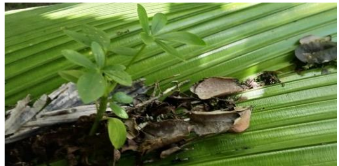
Schefflera seedling germinating in leaf litter ( Johannesteijsmannia magnifica )

Established in Hawaii prior to 1935, these species differentiate themselves from other invasive trees by their adaptability. They can all survive in both wet and dry regions and they all have the capacity to be hemiparasitic - germinating readily on other plants. Because their seeds are dispersed by birds, these trees can be found germinating in gutters, on utility poles, and within the canopy of other trees. They are of particular concern to palm growers because the seedlings often appear by the dozens within the crowns and remnant petioles of palms.