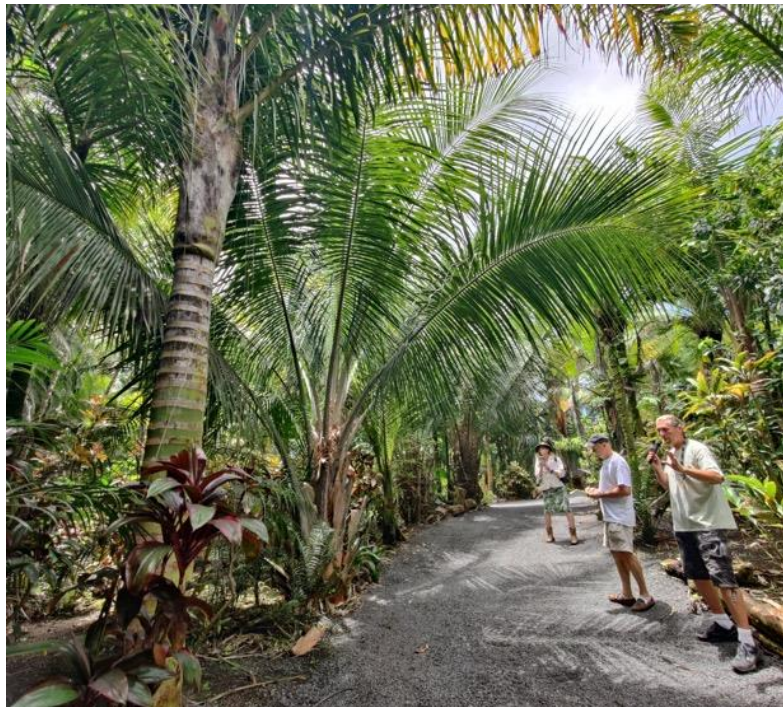
Members walk the broad paths and gather around Jerry as he points out the wonders of the garden. Jerry pointing out the newly named Chrysalidocarpus titan (left photo).

The Andersen garden is a HIPS favorite. The elegant curved pathways, waterfalls and ponds, garden structures and statuary, with an understory of anthuriums, begonias and philodendrons, makes this garden a botanical oasis in addition to being one of Hawaii's most significant palm collections. Jerry and Cindy are an inspiration of creativity, hard work, and resilience. Having recovered from the eruption in 2018 and the loss of many Ohia trees to rapid ohia death, the garden is transforming into a totally different kind of beauty as the palms are leaping up with all the additional sunlight. Around 80 members toured the garden with Jerry and visited with each other enjoying refreshments and browsing Jerry's nursery for things to take home.