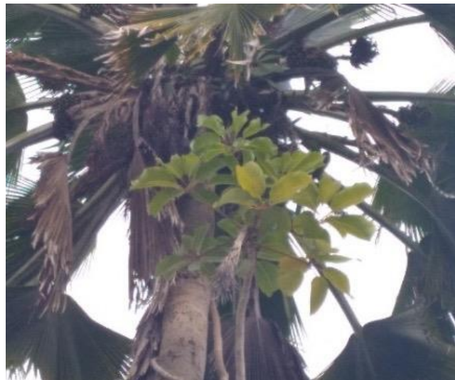
A young Schefflera in Loulu ( Pritchardia sp.)

These nuisance plants will often host other organisms damaging to palms. Scales, aphids, the ants that feed from them, and the associated sooty mold is often found on and around these invasives. The debris