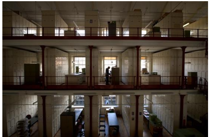
Viewing the boxes of palm specimens on the shelves (left), our group assembles at the foot of the iconic Victorian staircase (middle), the floors of specimen cabinets (right).

As mesmerizing and important as the herbarium objects are, the herbarium is not a museum. Baker points out that the greatest threat to the herbarium is not the preservation of its specimens, but the accessibility of its specimens for current scientific study. The herbarium is an extensive resource for plant taxonomy and