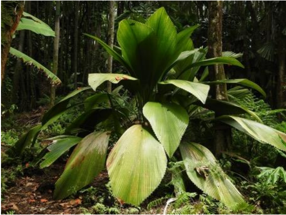
9-10 foot tall and 20 foot wide Johannesteijsmannia stands in the forest.