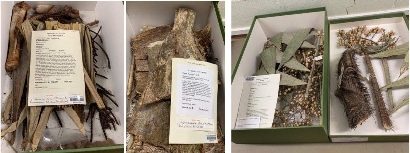
Herbarium samples: Tahina spectabilis from Madagascar(left), Dyopsis leucomalla from cultivation at Floribunda Palms and Exotics in Hawaii (middle), the spikey sections of a Calamus sp. from Indonesia (right).