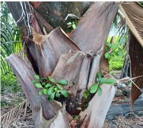
Clusia seedlings in leaf bases ( Marojejya darianii )