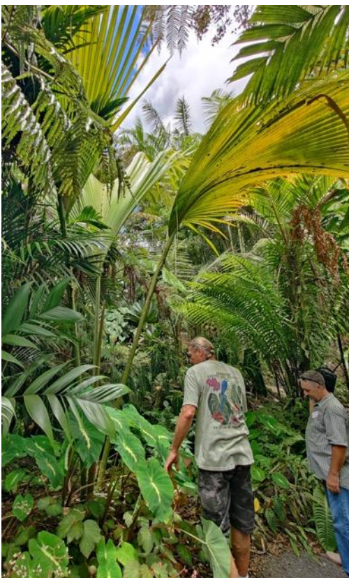
Upper left: Colorful palms and ti plants make a striking border. Upper right: The inviting garden pavilion entices the visitor to slow down. Lower left: Checking in on the double coconut Lodoicea one of the garden's rarest palms scarce in cultivation.