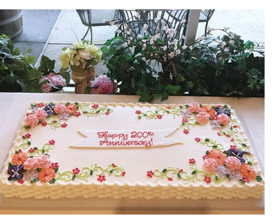
The Anniversary Cake.