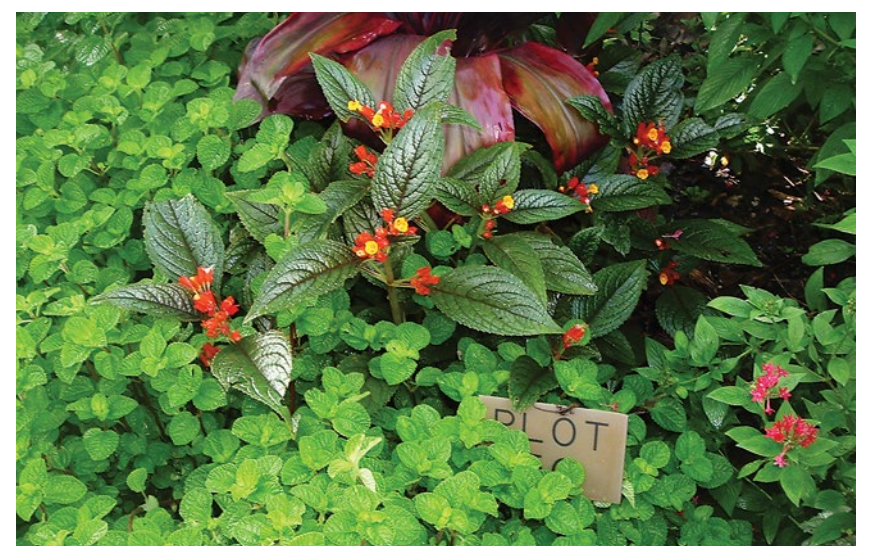
Chrysothemis pulchella growing at the Fairchild Botanical Garden in Florida in 2007.

The first conclusion of the analysis is that the Paradrymonia-Nautilocalyx-Chrysothemis complex is indeed nested in the Columneinae subtribe and is cleanly separated from the other genera in the subtribe.