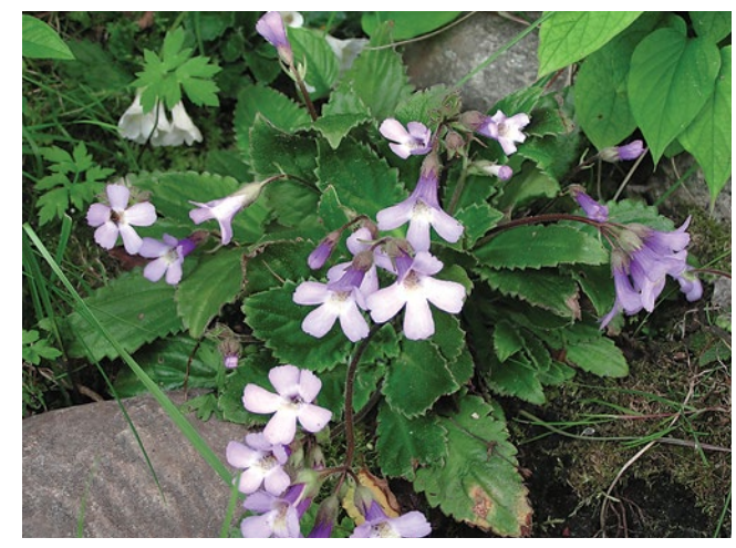
Left, Haberlea rhodopensis.

Below left, Sinningia bullata.