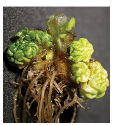
Conandron ramondioides dormant