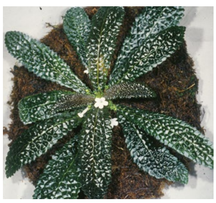
Nautilocalyx pemphidius exhibited by Elaine Gordon at the 2000 Gesneriad Society Convention Flower Show.

Drymonia with that sort of flower, even though most species in that genus have bell-shaped white flowers and most species with orange tubular flowers with a pouch on the bottom are in the genus Nematanthus .