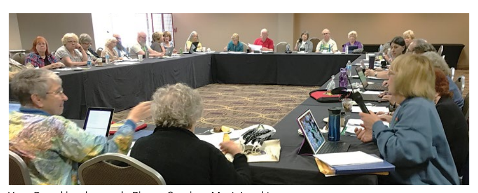
Your Board hard at work.