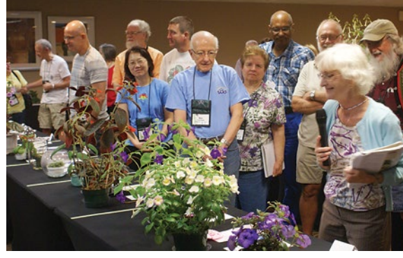
The Judges and Clerks Show Walk-Through.