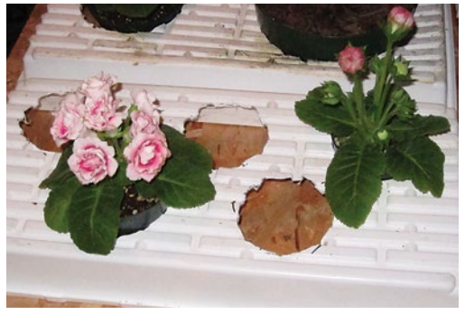
Transporting show plants from Toronto to Wilmington.

As noted, Streptocarpus 'Rose Scentsation' is a hybrid of Dale Martens' S. 'Texas Hot Chili' × S. vandeleurii . The latter is a very floriferous unifoliate species with strongly scented flowers that have been described as smelling like creosote. Some like it, some don't. I do.