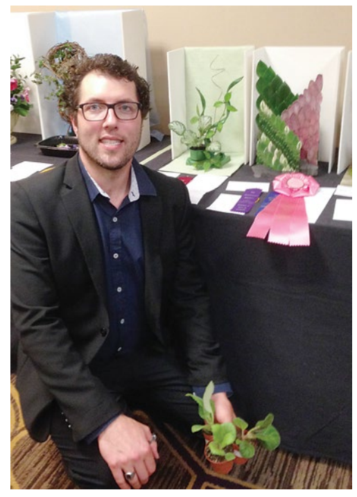
The author and his award-winning design.