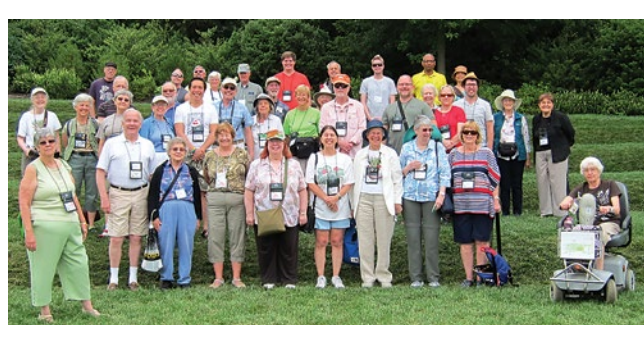
Conventioneers at Longwood Gardens.

wrong not buying a ticket. Winterthur was amazing on the inside and out. Many of the rooms reminded me of the apartment of Napoleon III in the Louvre. There was so much attention to detail the décor seemed to come to life in each room that we passed into. I was especially taken by the natural plantings outside that appeared to have always existed in the eastern forest that surrounded the house. This was a very special trip and I will remember it for years to come.