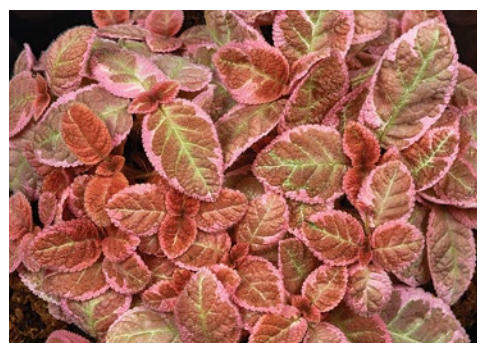
Episcia 'Pink Smoke' exhibited by Francisco Correa.