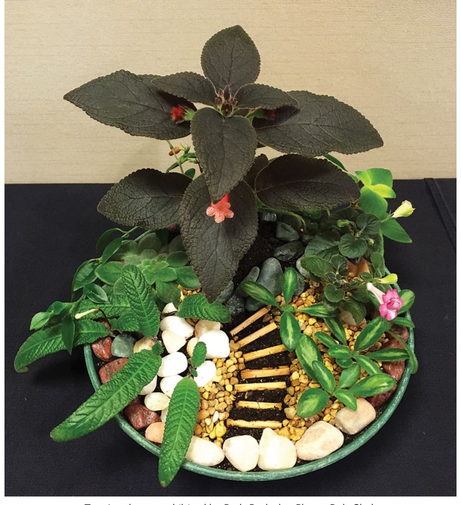
Tray Landscape exhibited by Barb Borleske.