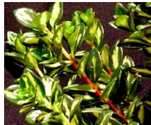
Nematanthus gregarious "Dibley's Gold"