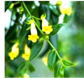
X Codonatanthus "Antique Gold"