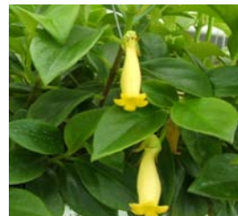
Nematanthus "Lemon Lime"