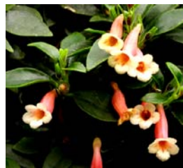
X Codonatanthus 'Vista'