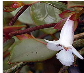
Codonanthe gracilis "Kautsky Red Leaf"