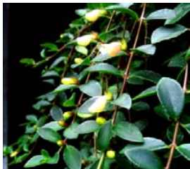
X Codonathanus 'Sunset'