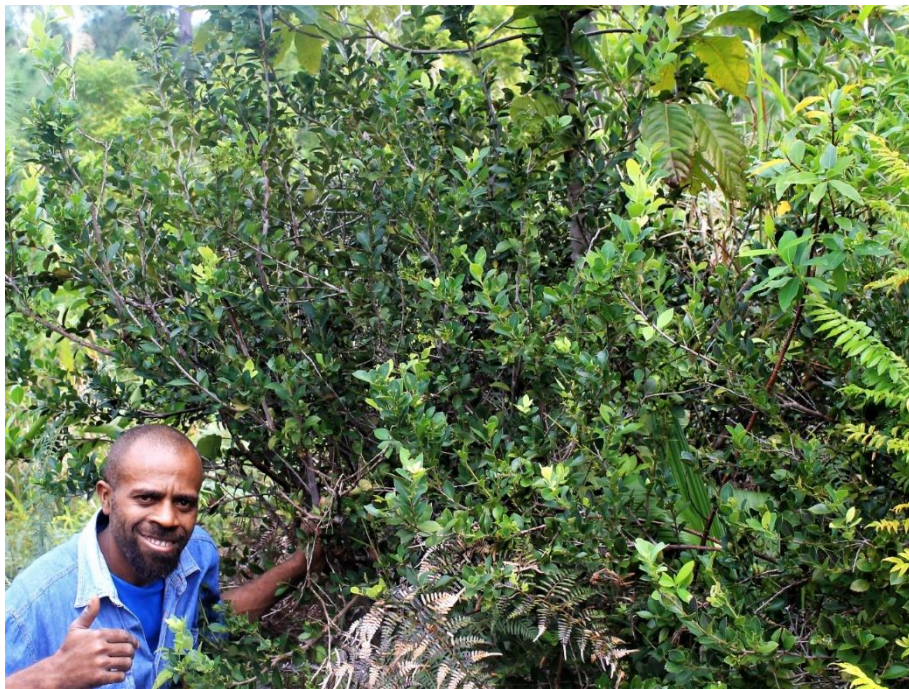
Above and above right. Vaccinium macgillivrayi . This blueberry, essentially from a northern hemisphere genus, somehow has found its way to a tropical island in the South Pacific. A clear example of natural distribution by birds.