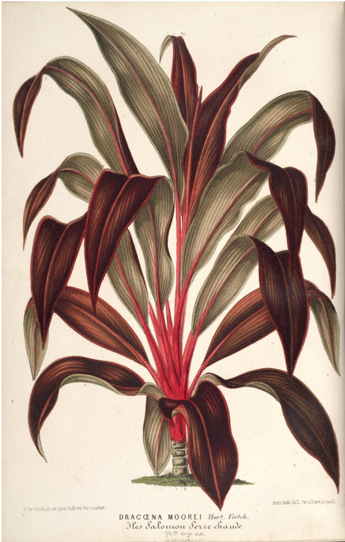
Moore's eponymous cordyline was a fine stovehouse plant