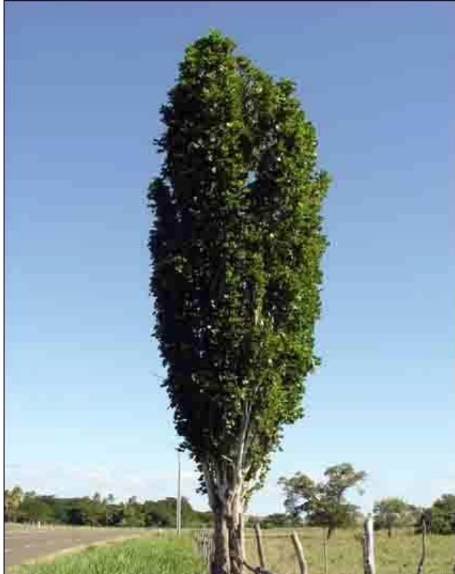
The fastigate variety of Erythrina variegata is still occasionally found on the east coast of New Caledonia.