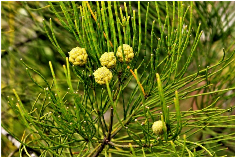
Gymnostoma deplancheanum . In its old herbarium collections, Kew Gardens hold an undated specimen of this species from New Caledonia with a Charles Moore collection number. The type specimen of this ‘casuarina’ was originally identified as Frenela subumbellata , the foliage being so similar to that of a cypress.