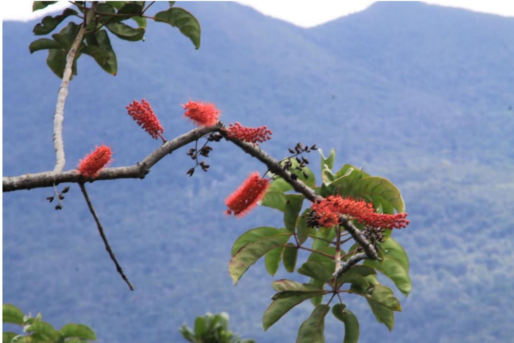
One of the interesting plants that Charles Moore encountered on the ultramafic soils of the east coast of New Caledonia was Geissois racemosa .