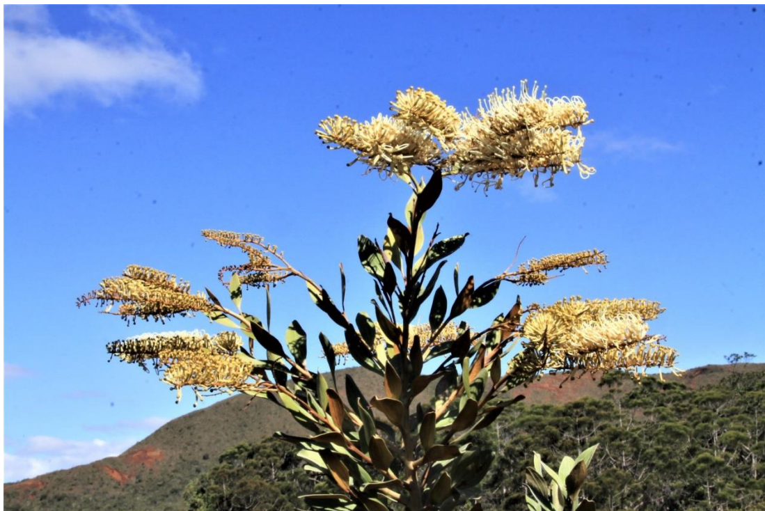
Grevilleas are well known as Australian native plants but are also found on New Caledonia as well as in Papua. Moore certainly found the species Grevillea exul during the Havannah's stay in Canala Bay.