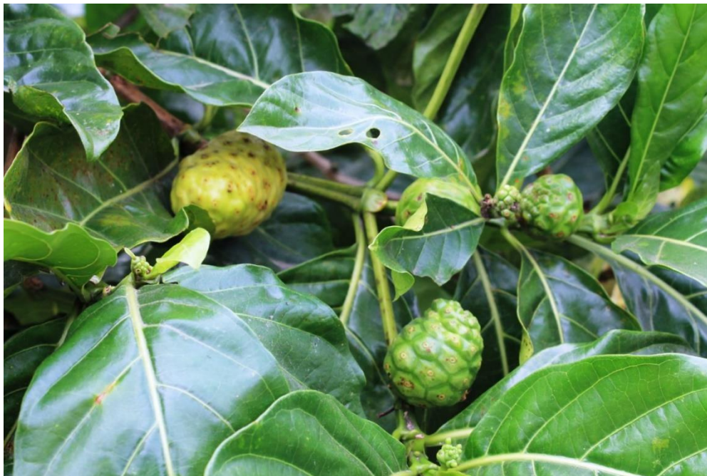
The green 'cones' of the Noni fruit, Morinda citrifolia

Another interesting tree that Moore found at Vanikoro, with a green fruit resembling a pine cone, is most likely to be Morinda citrifolia , the Noni. This species, commonly grown by South Pacific islanders, is now considered by some to provide a miracle health cure for multitudinous ailments.