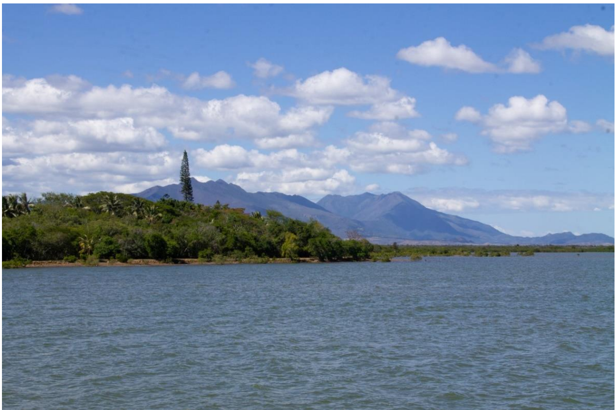
Toumo Bay with towering Araucaria columnaris and Mt Mou in the background

29th October. Sailed for Sydney after breakfast and got fairly to sea by 12 o'clock.