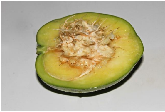
The edible fruit of Spondias dulcis . The spidery shaped kernel is bizarre.

Departing Vanuatu and sailing 400km due north, the next of the Melanesian islands was Vanikoro in the Santa Cruz Group, attained on 13 September. It was here that the ill-fated French La Pérouse Expedition met its disastrous end when both of the ships had been smashed on the surrounding reef during a storm. The