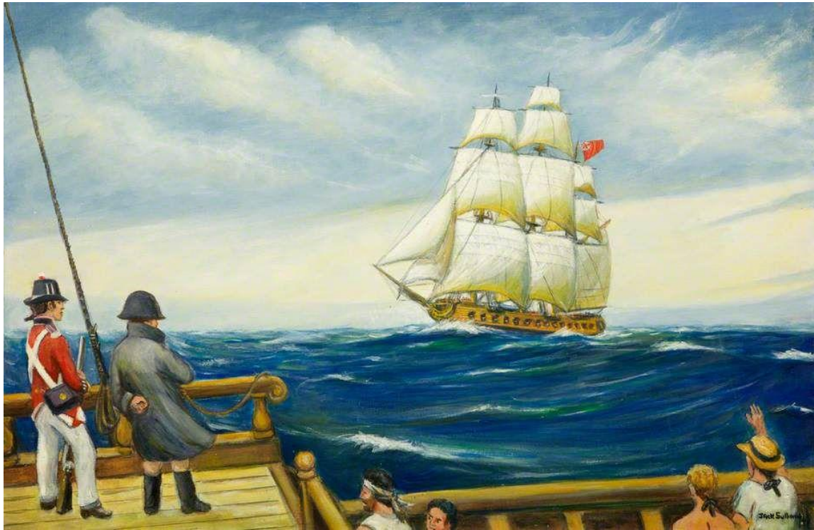
HMS Havannah