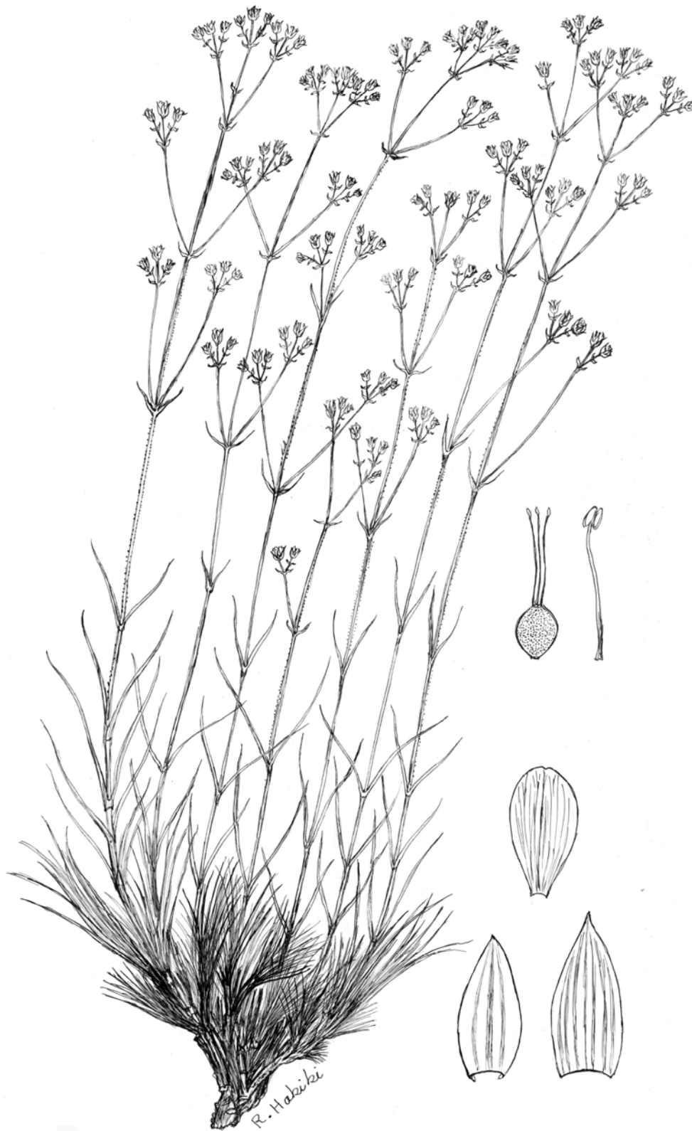
Fig. 2. Arenaria assadii ( \times 0.54 ); sepals and petal ( \times 5.4 ); ovary and stamen ( \times 8 ).