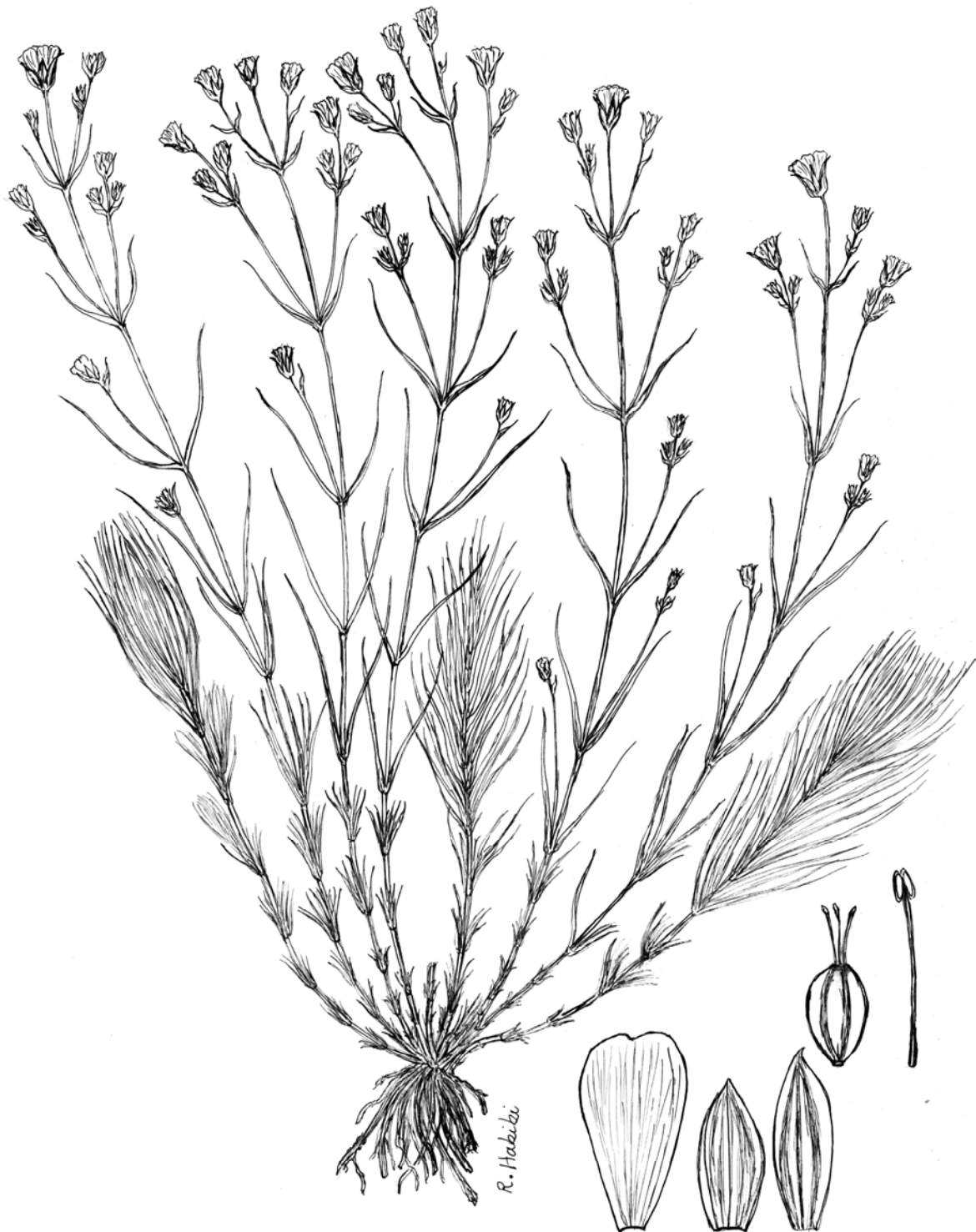
Fig. 3. Arenaria longibracteata ( \times 0.66 ); sepals and petal ( \times 3.3 ); stamen and ovary ( \times 6.6 ).