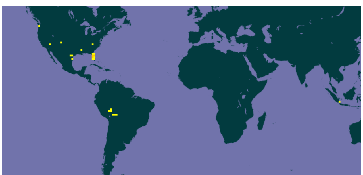
Figure 1. Map of known global distribution of Pterygoplichthys disjunctivus . Map from GBIF (2014).