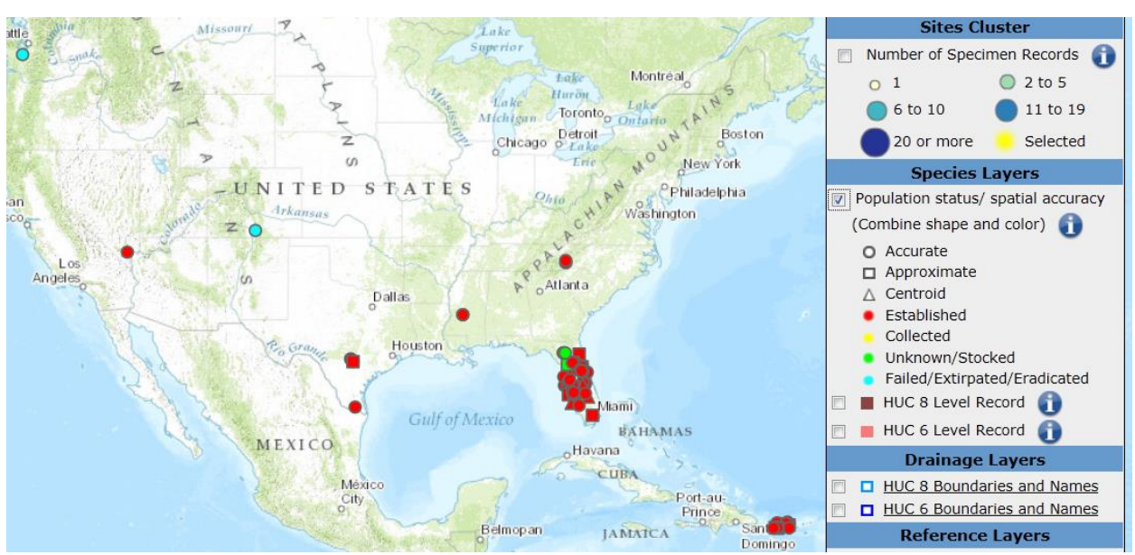
Figure 2. Distribution of Pterygoplichthys disjunctivus in the United States. Map from Nico et al. (2014).