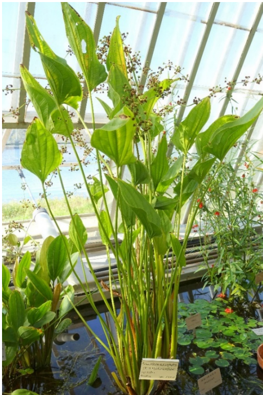
Photo: Daderot. Licensed under CC0 1.0. Available: https://commons.wikimedia.org/wiki/Main_Page . (April 2021).

Organism Type: Plant Overall Risk Assessment Category: Uncertain