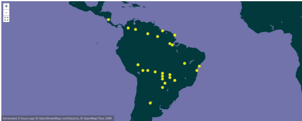
Figure 1. Known global distribution of Echinodorus scaber . Observations are reported from Argentina, Brazil, Bolivia, Colombia, Nicaragua, Paraguay, Suriname, and Venezuela. Map from GBIF Secretariat (2021).