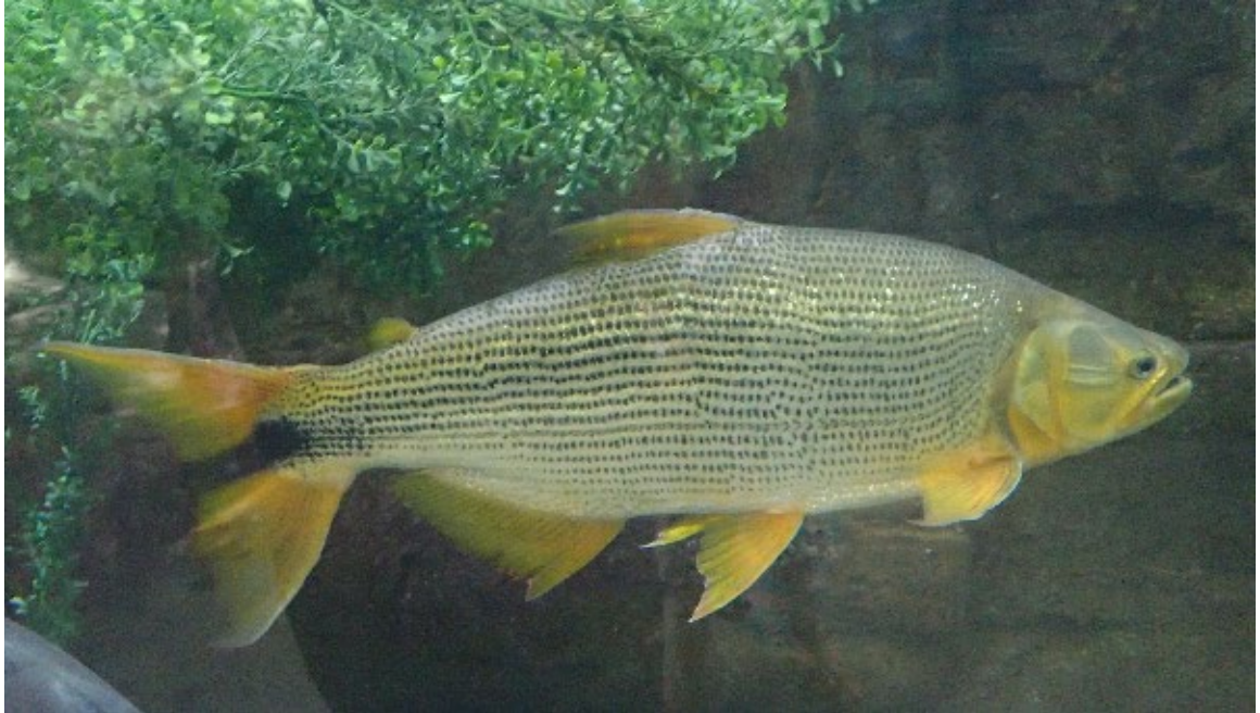
Photo: Brent Tibbatts. Licensed under CC-BY 3.0. Available: https://www.fishbase.se/summary/Salminus-brasiliensis.html (February 2022).

Organism Type: Fish Overall Risk Assessment Category: Uncertain