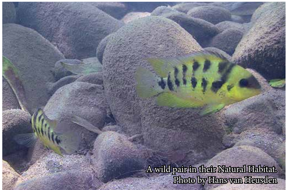
A wild pair in their Natural Habitat.

As stated earlier, you will know when the time comes for breeding. The female will change her color as you typically see with Apistogramma species to a very bright yellow with black stripes typically. The pair