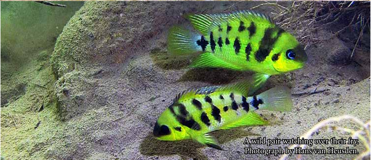
A wild pair watching over their fry.