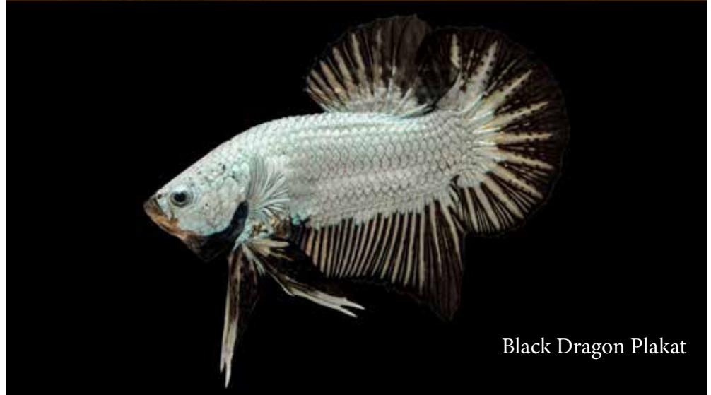
Black Dragon Plakat