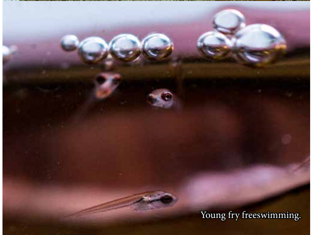
Young fry freeswimming.