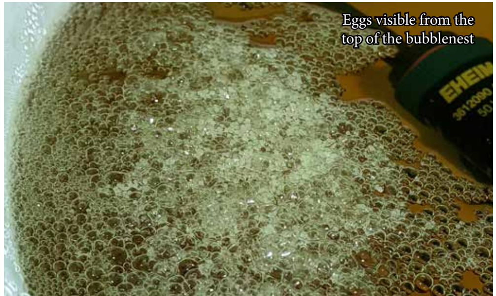
Eggs visible from the top of the bubble nest