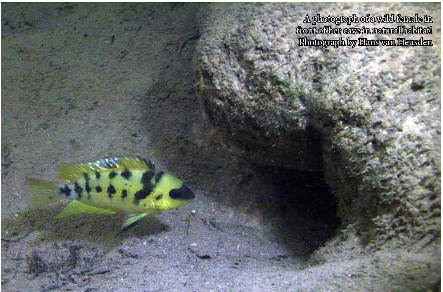
A photograph of a wild female in front of her cave in natural habitat!

So if you are looking for a mid sized Cichlid that is easy to keep, enjoyable to watch and also a CARES fish then this species is for you. I have now distributed hundreds of these "Yellow Cichlids" to fish keepers all over the United States. My recommendation is that you register them as a CARES fish and seriously use a few tanks to maintain this species. Not only are they a fun fish but they are one that you will probably want to keep in your long term fish collection. I will be updating their status as it changes in the wild. Unfortunately, we will probably never have a system that stays updated as there are not enough people in field doing research and like all other species are subject to habitat degradation, pollution and climatic changes modify their current habitat. As with so many species their survival may be in your hands. So why not give this species a try, you might just fall in love like I did.