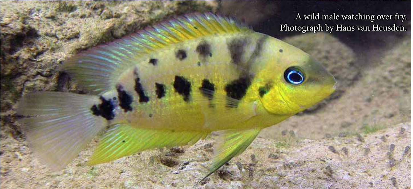
A wild male watching over fry.