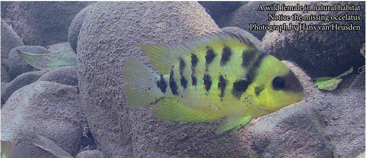
A wild female in natural habitat. Notice the missing ocellatus.