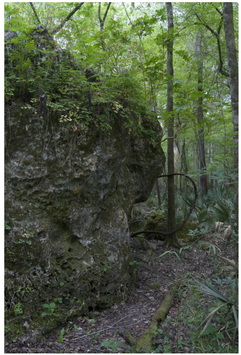
Florida Caverns State Park (Jackson County)