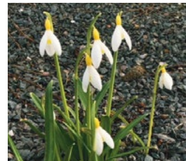
Galanthus 'Primrose Warburg'

Right outside, I found an array of troughs. Never have piles of rocks looked so appealing.