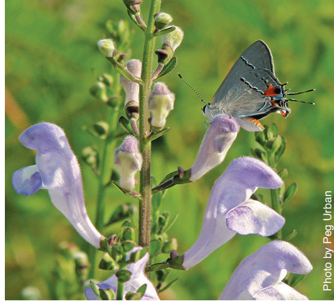
Hairstreak on Helmet skullcap

Flowers are two-lipped and resemble snapdragon blooms. They occur on terminal racemes and are very showy with colors ranging from sky blue to violet. The