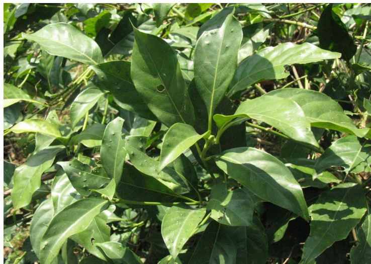
Hong Kong Pavetta ( Pavetta hongkongensis )