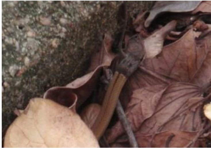
Chinese Mountain Snake ( Sibynophis chinensis chinensis )