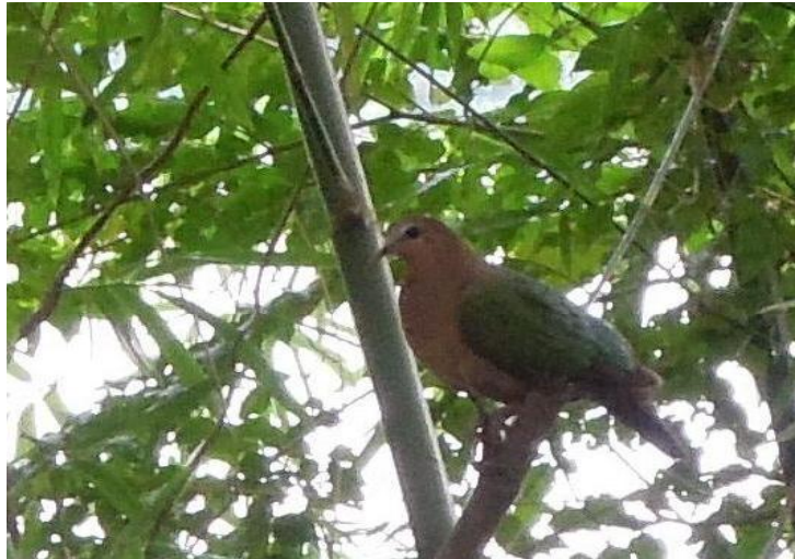
Common Emerald Dove ( Chalcophaps indica )