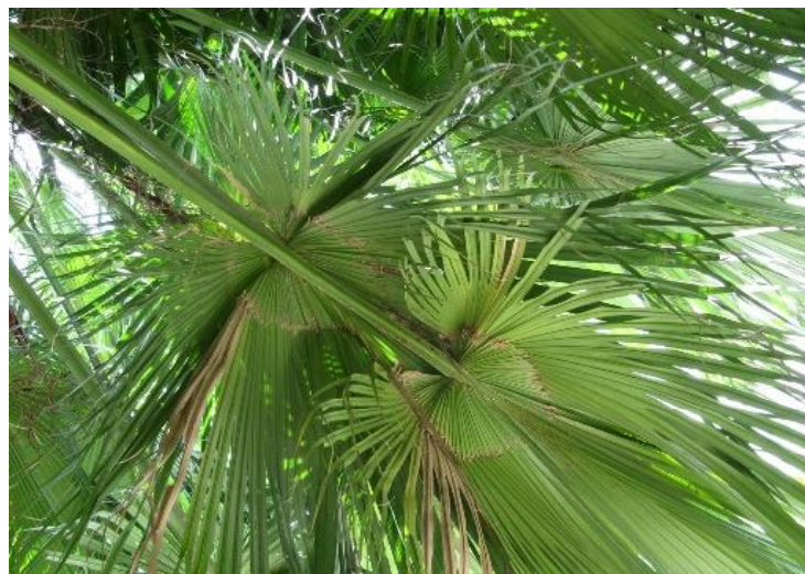
Abandoned Roosts of Short-nosed Fruit Bat ( Cynopteris sphinx )