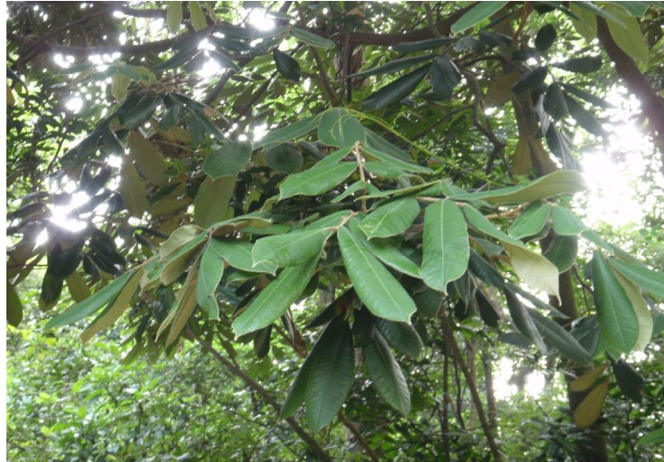
Hairy-Fruited Ormosia ( Ormosia pachycarpa )