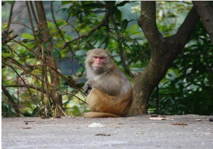
Rhesus Macaque ( Macaca mulatta )