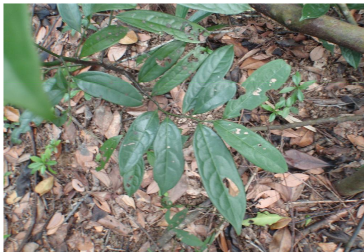
Hong Kong Eagle's Claw ( Artabotrys hongkongensis )