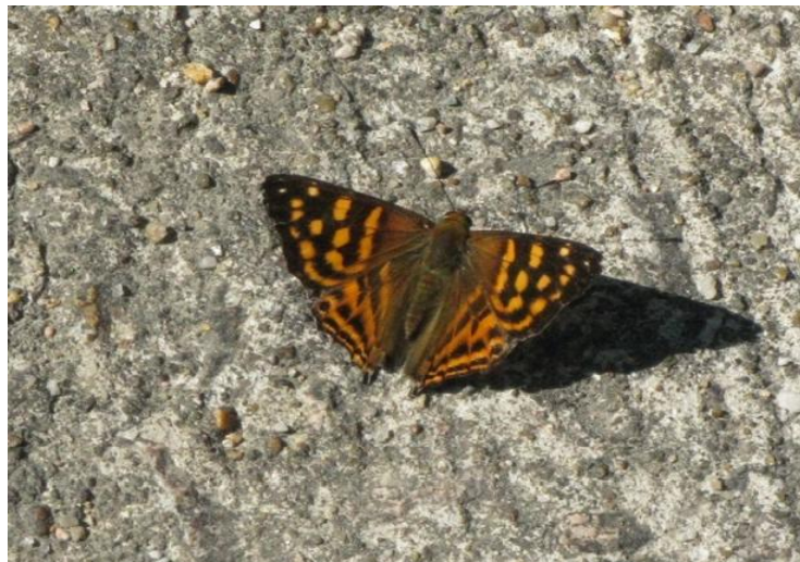
Orange Punch ( Dodona egeon egeon )