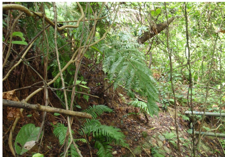
Lamb of Tartary ( Cibotium barometz )