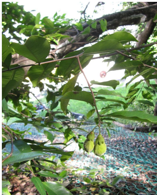
Incense Tree ( Aquilaria sinensis )