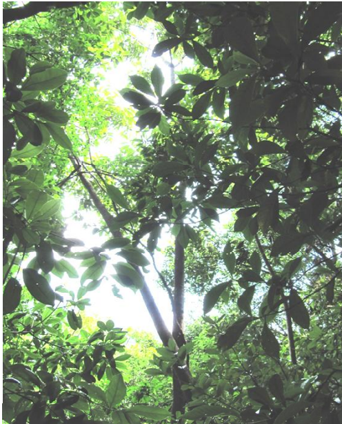
Ailanthus ( Ailanthus fordii )