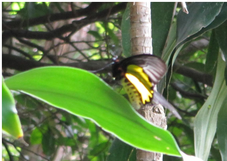
Golden Birdwing ( Troides aeacus aeacus )