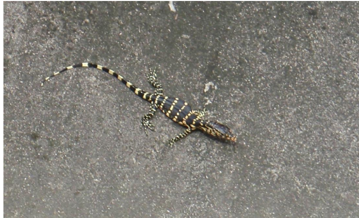
Common Water Monitor ( Varanus salvator )