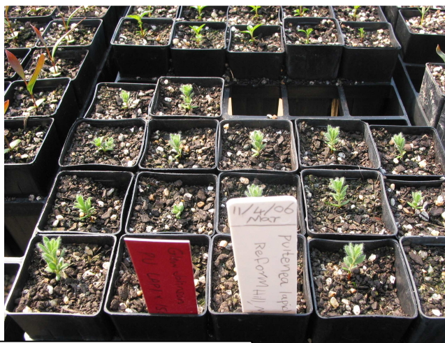
Myrtleford Secondary Students July 2007 Planting