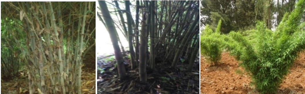
Figure 5: Growth performance of Dendrocalamus membranaceus at Chagnii (left), Tepi (middle) and Holetta (right) three years after establishment

Leaves: Leaves 25 x 2.5 cm, hairy on midrib and beneath; inflorescence compound panicle, with distinct globular heads on nodal points, spikelets closely grouped.