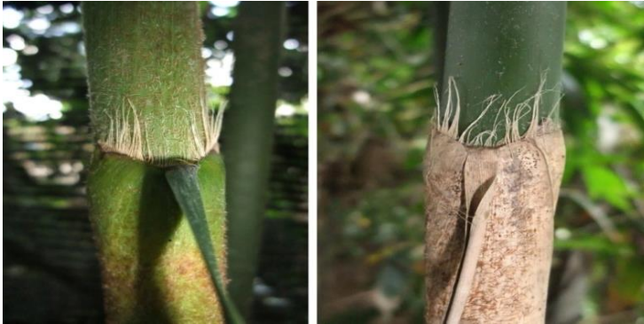
Figure 26: Culm features of Schizostachyum jaculan (Anonymous, 2016)

Culm-sheaths: 30 cm long, copiously brown-hairy on the back (Figure 26); blade green, soon reflexed, up to 25 x 1.8 cm; auricles about 1 mm high but 1.7 cm wide on each side, with pale bristles up to 1.2 cm; ligule 2 mm high with fringing hairs 3 mm tall.