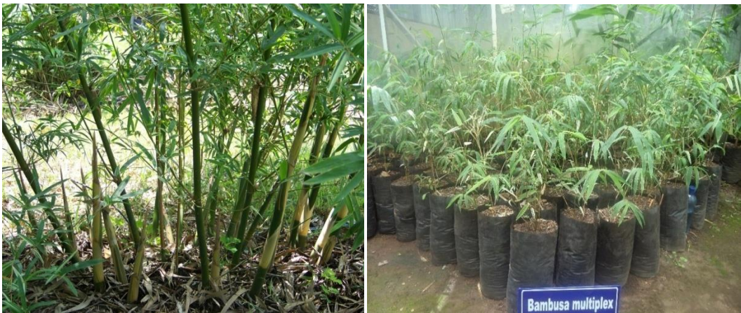
Figure 12: A clump of Bambusa multiplex silver stripe (source: Anonymous, 2016) at field condition (left) and at its seedling stage at greenhouse condition at FRC (right).

Leaves: New leaves have white stripes (Figure 12). That is what gives this particular strain of Bambusa multiplex the name "Silverstripe."