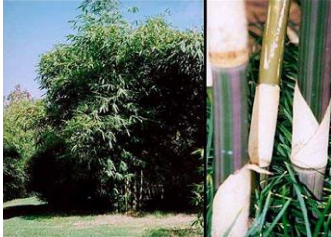
Figure 18. Gigantochloa kuring Sumatra.

Leaf-sheath: Leaf-sheath auricles falcate; 1–2 mm long. Ligule a ciliate membrane. Collar with external ligule. Leaf-blade base with a brief petiole-like connection to sheath. Leaf-blades lanceolate; 12–24 cm long; 16–22 mm wide. Leaf-blade surface glabrous.