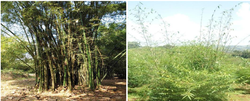
Figure 6: A mature clump of Bambusa vulgaris Var. green (left, sources: Anonymous, 2016; Stephone Schroder, 2011) and performance of the species under field condition at Jimma one year after establishment from seedling (right)

Leaves: narrow or broadly lanceolate, 15-25 cm long and 2-4 cm broad rounded or attenuate at the base into a 5 mm long petiole, glabrous on surfaces, occasionally sparsely hairy when young, margin scabrous.