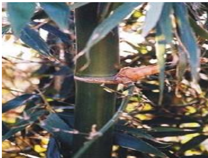
Figure 10: Branch features of Bambusa balcooa

Flowering and fruiting: Gregarious flowering and seed-setting usually occurs every 35-45 years, flowering was last reported between 1983-1988.