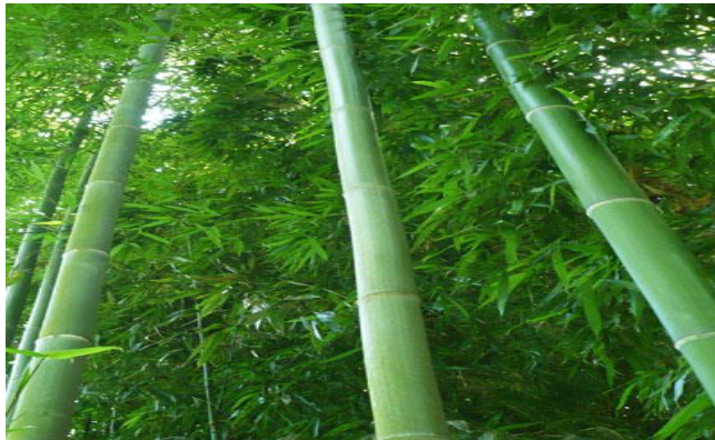
Figure 24: Phyllostachys bambusoides .

Leaves: Leaves are dark green. The foliage acquires an orange tinge when grown with the correct amount of shade.