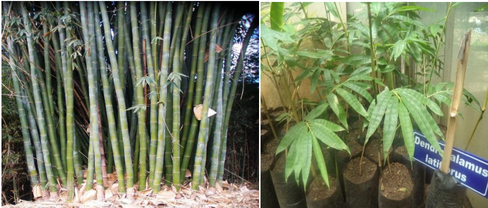
Figure 16: Structure of a mature clump of Dendrocalamus latiflorus (left, Anonymous, 2016); seedling multiplication at Gurd Shola nursery of the Central Ethiopia EFRC (right)

Leaves: Leaf-blades are lance-shaped and between 15-40 cm long and 25-75 mm wide.