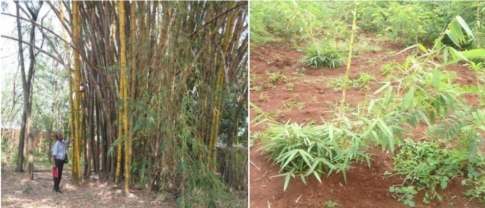
Figure 7: A mature clump of Bambusa vulgaris var. vitata (left, photo by Mr. Tesfaye Hunde) and field performance of the species propagated using culm cutting.

Flowering and fruiting: At the interval of several decades, the whole population of an area blooms at once, and individual stems bear a large number of flowers, but fruits are rare due to low pollen viability caused by irregular meiosis. The clump survives after the culms die after flowering.