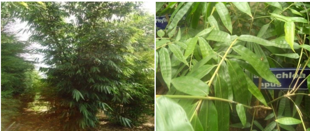
Figure 17: Gigantochloa apus growth performances at Holetta (Central Ethiopia) at the age of 2 years (left) and seedling performance at Central Ethiopia EFRC (right).

Leaf-sheath: Auricles erect; 1-2 mm long. Ligule a ciliolate membrane; 1-2 mm long. Collar with external ligule. Leaf-blade base with a brief petiole-like connection to sheath; petiole 0.4-1.1 cm long. Leaf-blades lanceolate; 13-49 cm long; 20-90 mm wide.