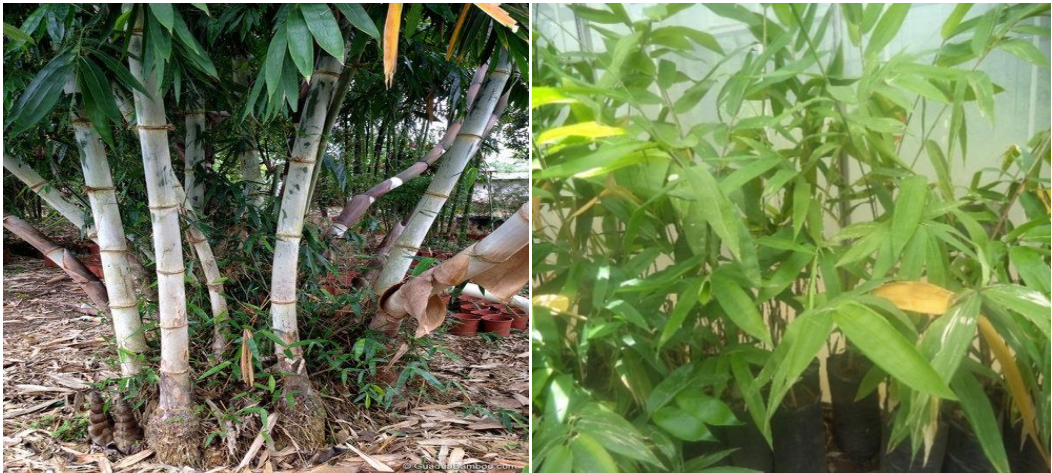
Figure 15: Dendrocalamus brandisii growth performance at field (left, Anonymous, 2016) and greenhouse FRC (right).

Leaf sheaths: Are straightly veined and pubescent. Base of the leaf blade may have a brief petiole like connection to sheath. The blades are lanceolate or oblong and pubescent.