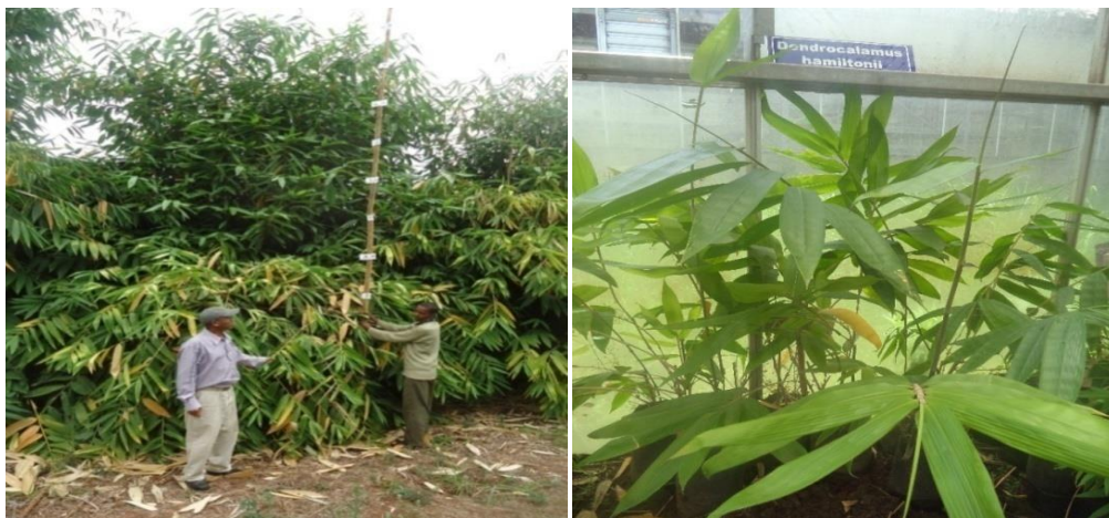
Figure 3: Growth performance of Dendrocalamus hamiltonii at Jimma three years after planting (left) and seedling multiplication at greenhouse at Central Ethiopia EFRC (right).

Leaves: variable, small on side branches, but on young plants they reach 37.5 cm long and 3.5 cm wide, rounded at the base into a short thick petiole; leaf sheath covered with white, appressed stiff hairs.