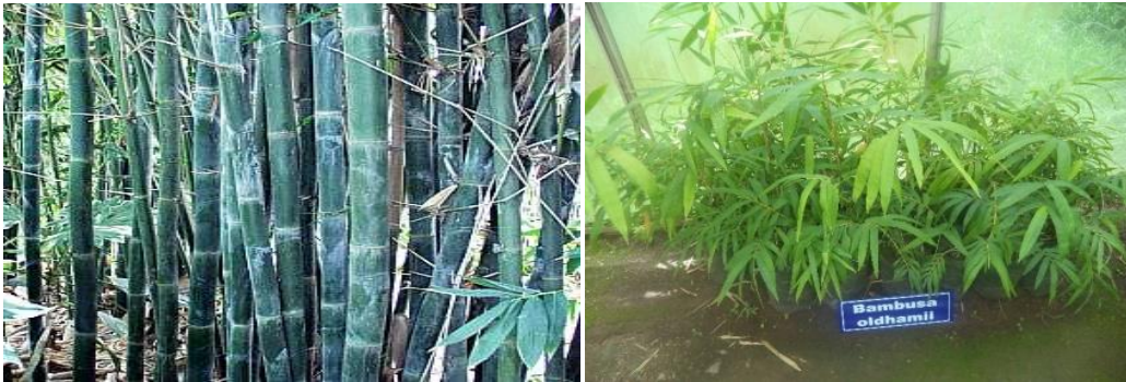
Figure 14: A clump of Bambusa oldhamii (left, Anonymous, 2016) and seedling multiplication in greenhouse of Central Ethiopia EFRC (right).

Leaves: The large leaves of this bamboo give it what some would call a tropical look. Leaf sheaths are striate, glabrous or sparsely hispidulous, margins very shortly ciliate; auricles very small, rounded; fimbriae many, to 5 mm, fine, wavy; ligules to 1 mm, truncate, glabrous, entire; blades 15–30 cm long, 3–6 cm wide, oblong-lanceolate, abruptly acuminate, abaxial surfaces pubescent initially, becoming glabrous, adaxial surfaces glabrous.