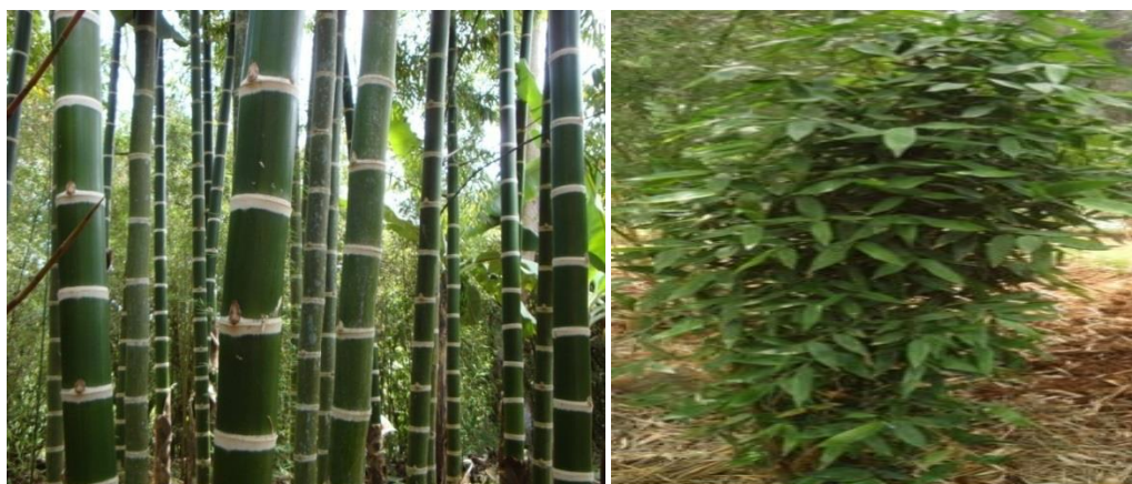
Figure 20: A mature stand of Guadua angustifolia (left, source: Anonymous, 2016); growth performance at Holetta testing site (right)

Flowering and fruiting: Inflorescence is borne on leafless or leafy twigs, 6-7cm long, linear, solitary and fasciculate. Spikelets curved with 14-14 florets with apical 4-6 florets more or less tabescent. Spikelets also absciss on maturity. Rachis segments are upto 3-4mm long, tomentose with 1-2 gemmiparous bracts which are triangular in shape.