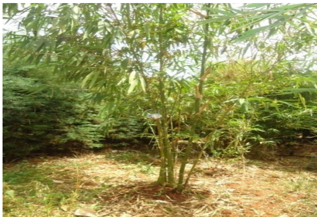
Figure 19: A clump of Gigantochloa atter

Leaves: Foliage-leaf blades are large, 20 - 44 cm long, 3 - 9 cm wide and glabrous.