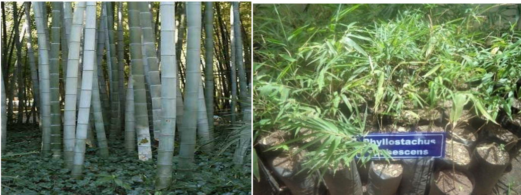
Figure 21: A mature stand of Phyllostachys pubescens (left), seedling multiplication at Gurd Shola nursery, Central Ethiopia EFRC (right)

Flowering and Fruiting: Flowering cycles are not predictable, and occur only rarely, perhaps every 50 to 100 years. The old idea that bamboo dies in mass after flowering does not seem to hold with this species. Rather, an odd patch of culms will flower here and there.