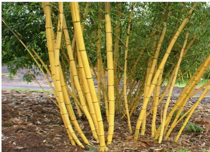
Figure 22: Phyllostachys vivax 'Aureocaulis' (Anonymous, 2016)