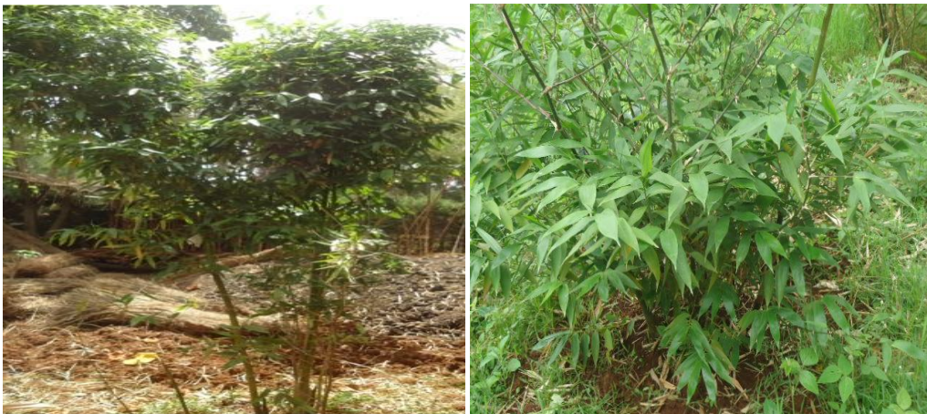
Figure 8: Guadua amplexifolia growth performance at Holetta (left) and Jimma (right)

Leaves: Are evergreen and leaf length reached 16-24 cm. Leaf-sheaths are glabrous on surface and oral hairs setose. Leaf-sheath auricles falcate is 20-35 mm long. Ligule an eciliate membrane is 0.5 mm long. Collar with external ligule. Leaf-blade base with a brief petiole-like connection to sheath. Leaf-blades lanceolate; 16-24 cm long; 30-51 mm wide. Leaf-blade surface glabrous. Leaf-blade apex acuminate.