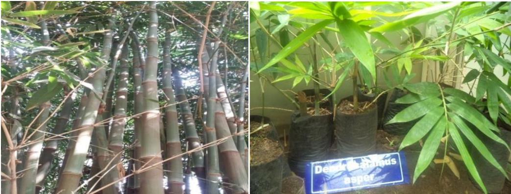
Figure 2: Growth performance of Dendrocalamus asper at field condition at Chagnii (four years after planting, left), seedling multiplication at greenhouse of Central Ethiopia EFRC (right)

Leaves: 5-9 on each twig, pseudo spikelets often in spherical dense clusters at the nodes of leafless branches. Leaf 30 x 2.5 cm.