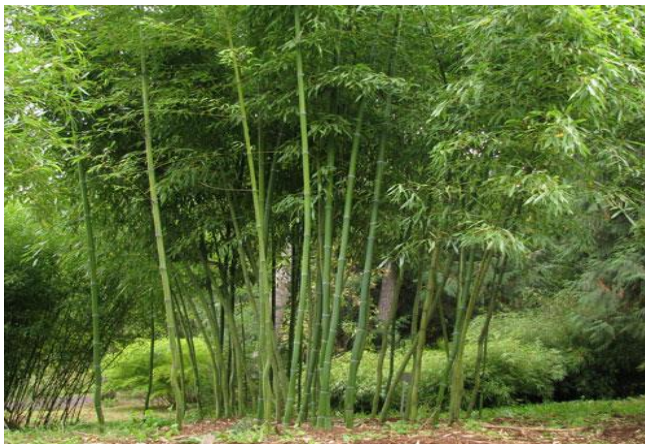
Figure 25: A clump of Phyllostachys iridescens .

Leaves: It has 3 or 4 per ultimate branch; auricles absent; oral setae deciduous, purple; ligule moderately exserted, purple-red; blade 8–17 × 1.2–2.1 cm.