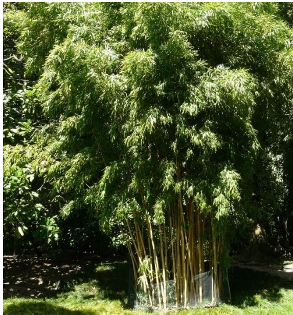
Figure 23: A clump of Phyllostachys aurea Carrière (Anonymous, 2016)

Flowers and fruiting: Flowering is infrequent and unpredictable; flowers are grass like and not especially showy. Flowers have never been observed in much of the United States. When produced, flowers occur in spikelets up to 2 inches (2.5 cm) long with 8 to 12 flowers.