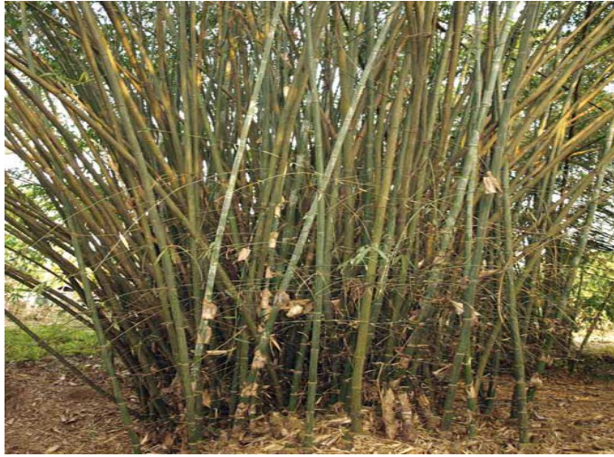
Figure 13: Matured clump of Bambusa tulda

Flowering and fruiting: This species flower gregariously. The flowering cycle is 30 to 60 years. Under ambient conditions, the seed remains viable for about 1 month only; when stored dry (in a desiccators over silica gel) viability can be extended to up to 1.5 years.