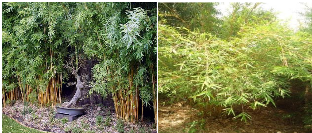
Figure 11: A mature clump of Bambusa multiplex (left, source: http://www.bambooweb.info ) and at Holetta (right, photo by Belayneh Azene).

Leaves: are fairly large and remain lush green.