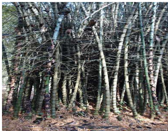
Figure 9: A mature clump of Bamusa bambos

Flowering and fruiting: This species flower gregariously and clump dies after flowering. The flowering cycle is 30 -to 45 years.