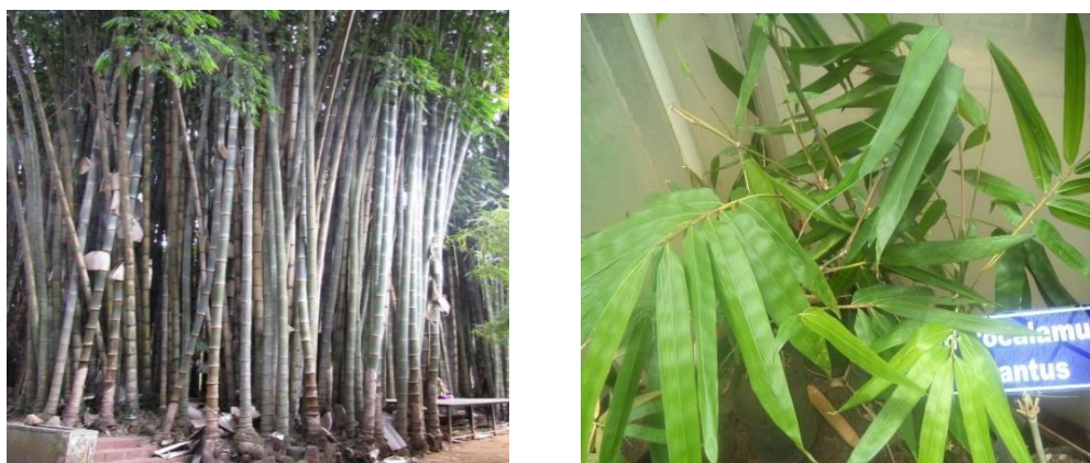
Figure 4: A mature clump of Dendrocalamus giganteus (left); seedling multiplication at greenhouse of Central Ethiopia EFRC (right)

Flowering and fruiting: So far gregarious flowering of this species has not been reported. Flowering cycle is 40 years.