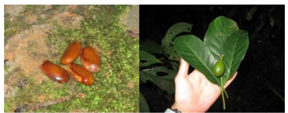
Photo 2 Plant material collected on the Amazonian side of the Andes. On the left: Sapotaceae's seeds. On the right: fruit and leaves. This material was part of the collections made at the Putumayo department.