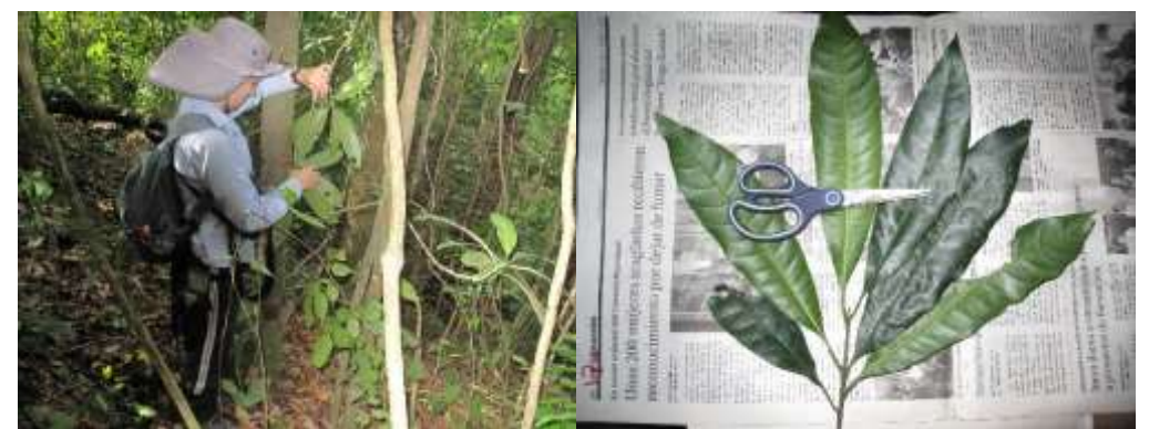
Photo 1 Collection and mounting of specimens. On the left: Collection of specimens from trees reaching less than 5 metres height. Right: Specimen classified within the genus Pouteria after preparations for the temporary mounting on newspaper.

Specimens were mounted and kept on newspaper away from moisture. Photos, coordinates and field notes were gathered for each of them (Photo 1).