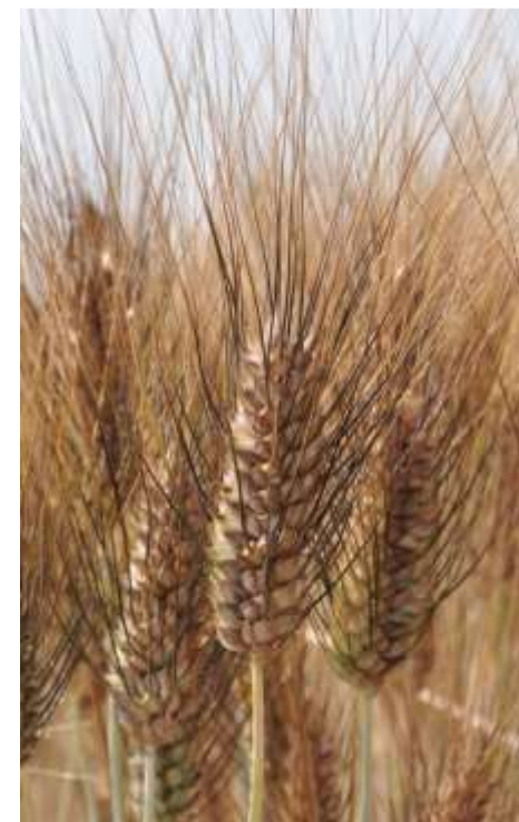
var. apulicum Koern.