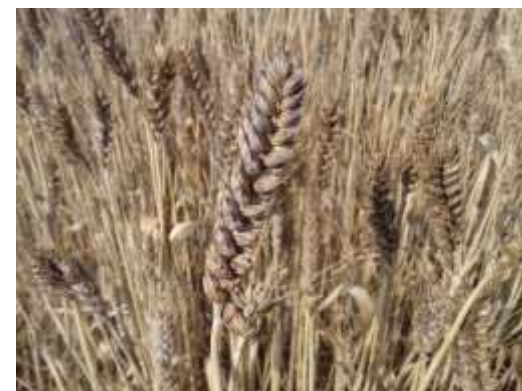
var. milturum (Alef.) Mansf.