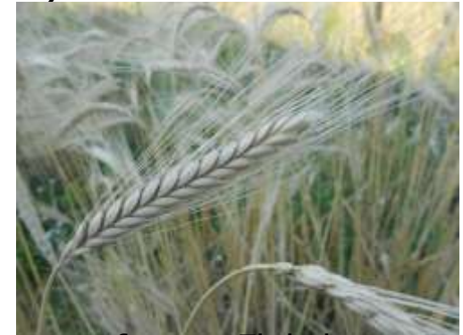
var. farrum Flaksb.