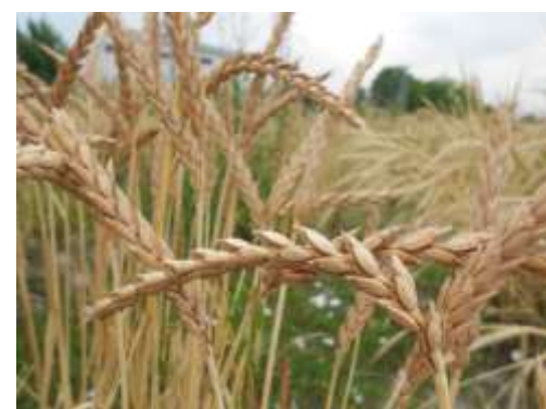
Triticum spelta L. var. duhalemianum