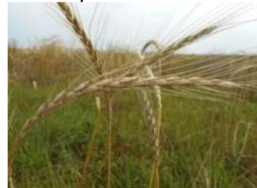
Triticum spelta L. var. arduini