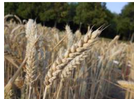
var. lutescens (Alef.) Mansf.