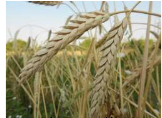
var. tricoccum Koern.