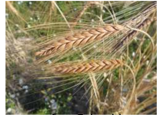
var. rufum Schuebl.