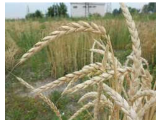
Triticum spelta L. var. album