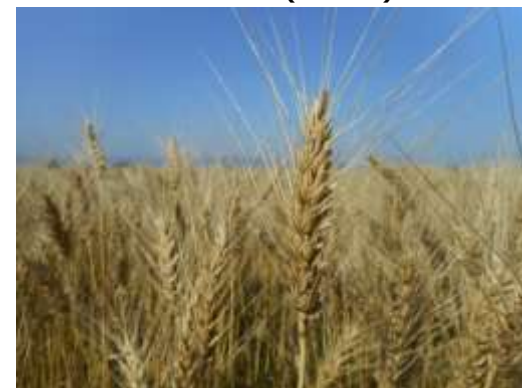
var. erythrosperrum Koern.