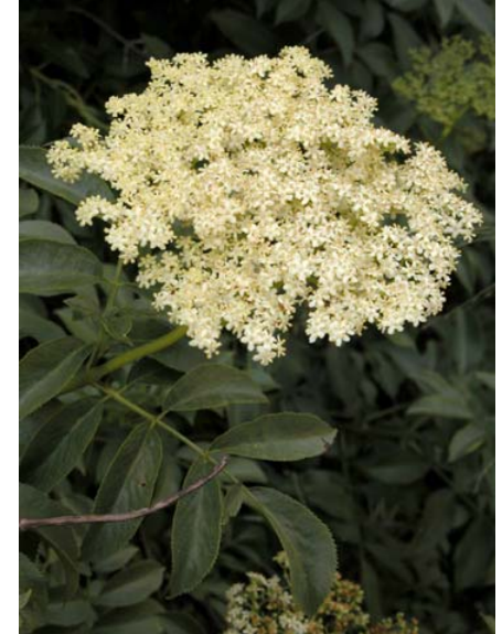
Blue Elderberry Sambucus mexicana Native Perennial Honeysuckle Family