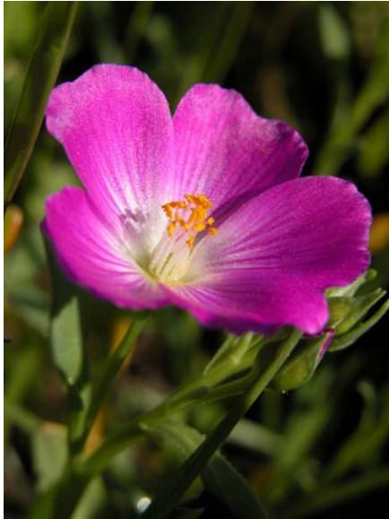
Magenta Red Maids Calandrinia ciliata Native Annual Purslane Family