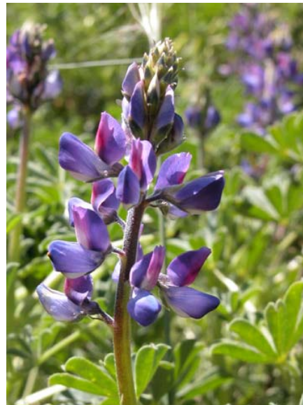
Arroyo Lupine Lupinus succulentus Native Annual Pea Family