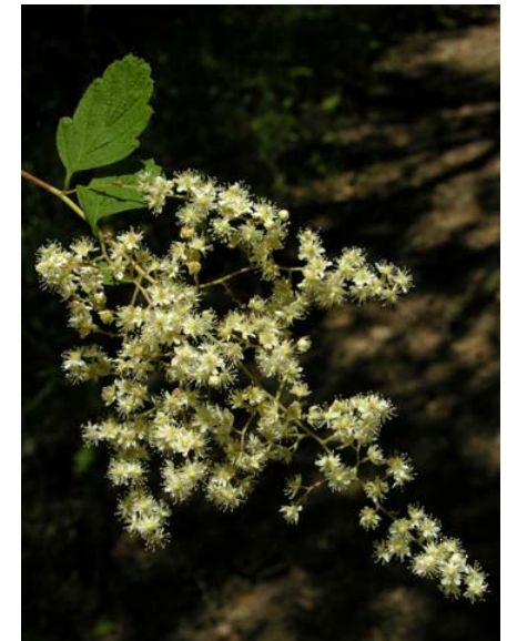
Creambush / Ocean Spray Holodiscus discolor Native Perennial Rose Family