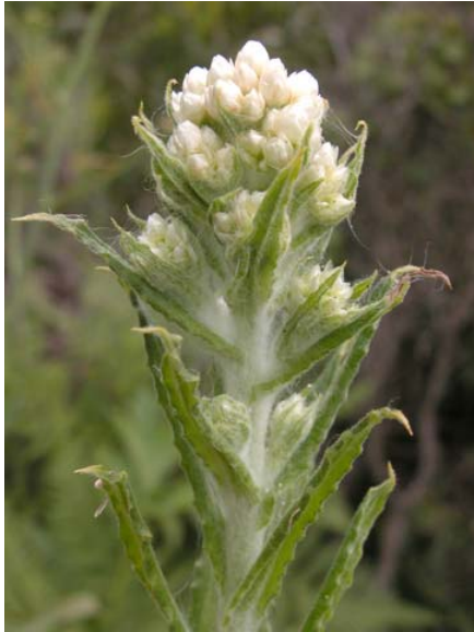
California Everlasting Gnaphalium californicum Native Biennial Sunflower Family