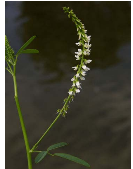
White Sweet Clover Melilotus alba Introduced Annual-Biennial Pea Family