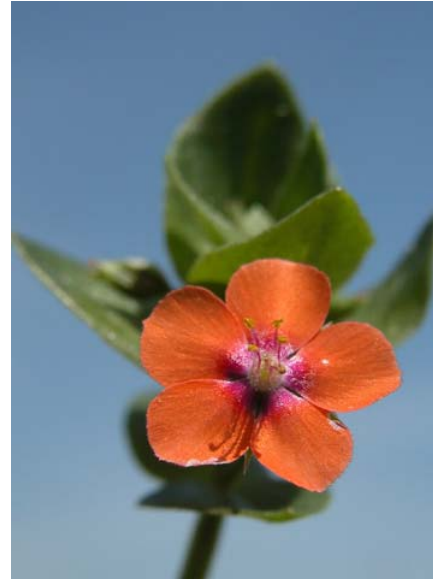
Scarlet Pimpernel Anagallis arvensis Introduced Annual Primrose Family