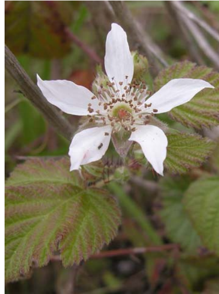
Native California Blackberry Rubus ursinus Native Perennial Rose Family