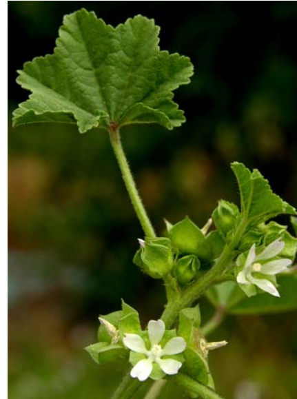
Hidden-flower Cheeseweed Malva parviflora Introduced Annual Mallow Family