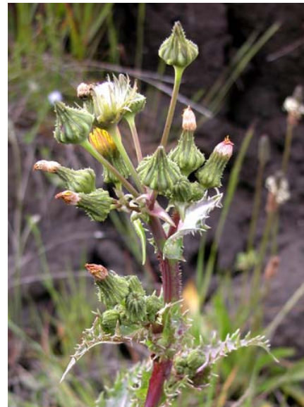
Prickly Sow Thistle Sonchus asper ssp. asper Introduced Annual Sunflower Family