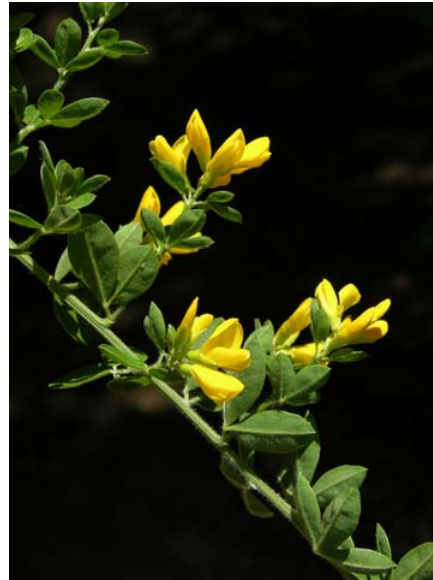
French Broom Genista monspessulana Introduced Perennial Pea Family