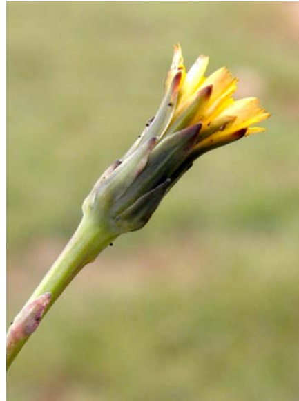
Smooth Cat's-ear Hypochaeris glabra Introduced Annual Sunflower Family