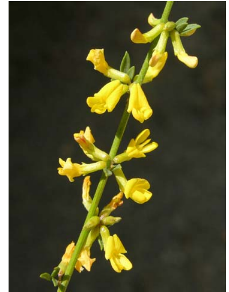
Deerweed Lotus scoparius var. scoparius Native Perennial Pea Family