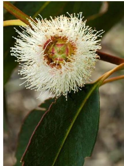
Blue Gum Eucalyptus globulus Introduced Perennial Myrtle Family