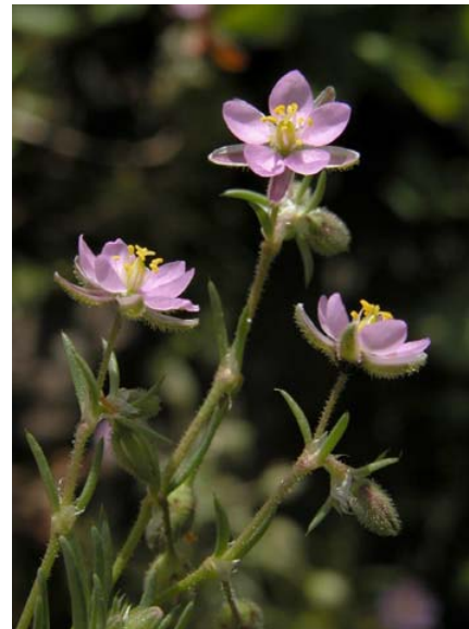
Ruby Sand Spurry Spergularia rubra Introduced Annual-Perennial Pink Family