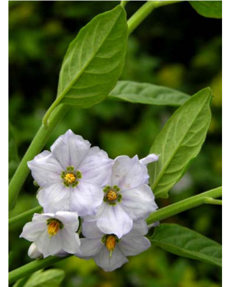
Blue Witch Solanum umbelliferum Native Perennial Nightshade Family