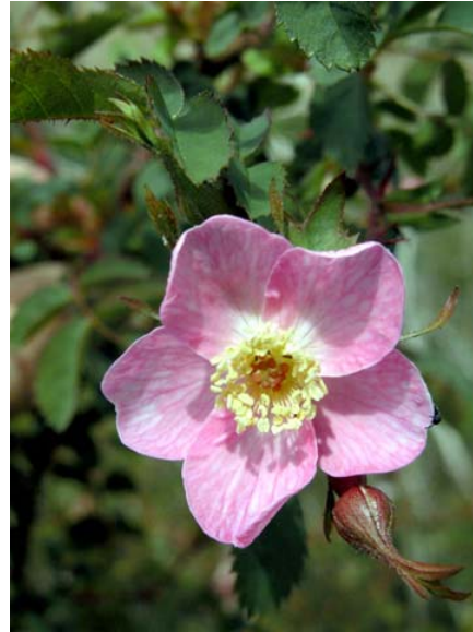
California Wild Rose Rosa californica Native Perennial Rose Family