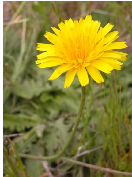
Rough Cat's-ear Hypochaeris radicata Introduced Perennial Sunflower Family