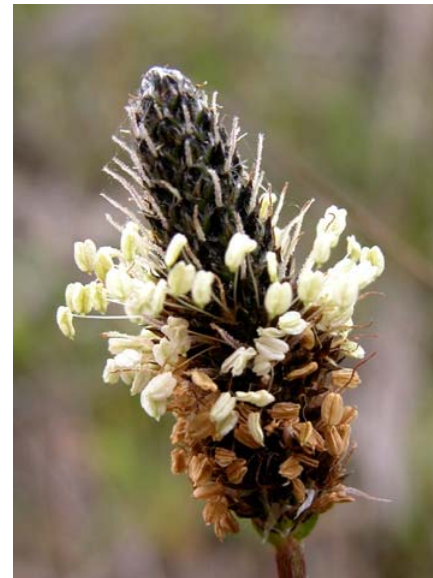
English Plantain Plantago lanceolata Introduced Annual Plantain Family