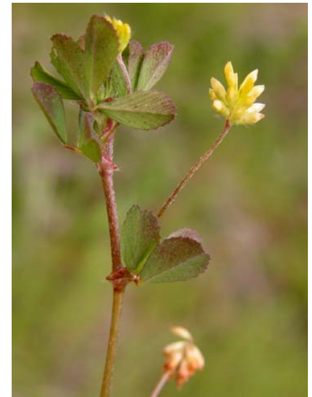
Shamrock Clover Trifolium dubium Introduced Annual Pea Family