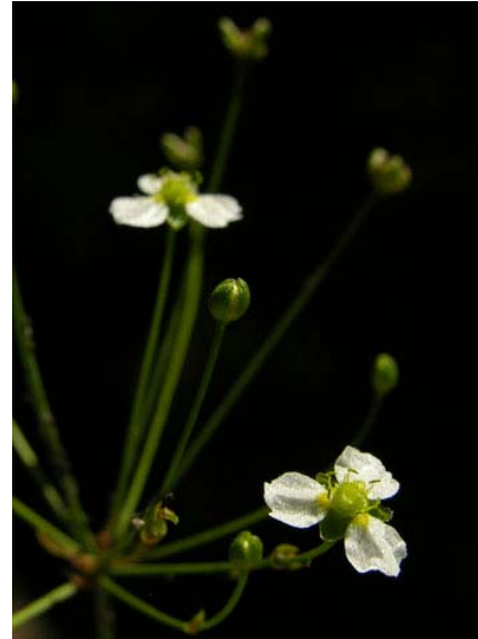
Common Water Plantain Alisma plantago-aquatica Native Perennial Water-Plantain Family