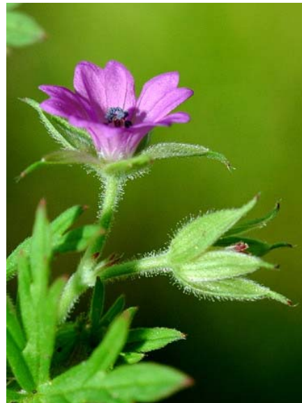
Purpletip Cut-leaf Geranium Geranium dissectum Introduced Annual Geranium Family