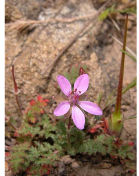
Red-stem Filaree Erodium cicutarium Introduced Annual Geranium Family