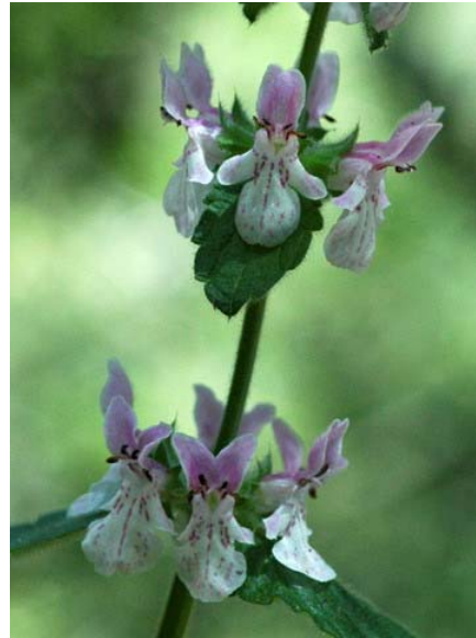
Common Rigid Hedge Nettle Stachys ajugoides var. rigida Native Perennial Mint Family