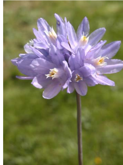
Blue Dicks Dichelostemma capitatum ssp. capitatum Native Perennial Lily Family