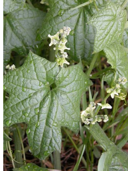
Common / California Manroot Marah fabaceus Native Perennial Gourd Family