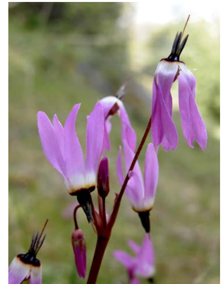
Mosquitobills Shooting Star Dodecatheon hendersonii Native Perennial Primrose Family