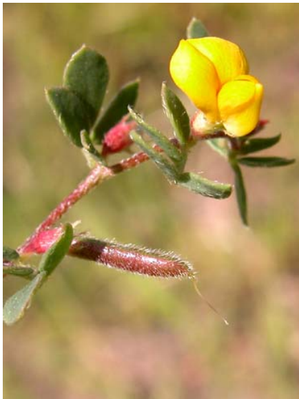
California Lotus Lotus wrangelianus Native Annual Pea Family