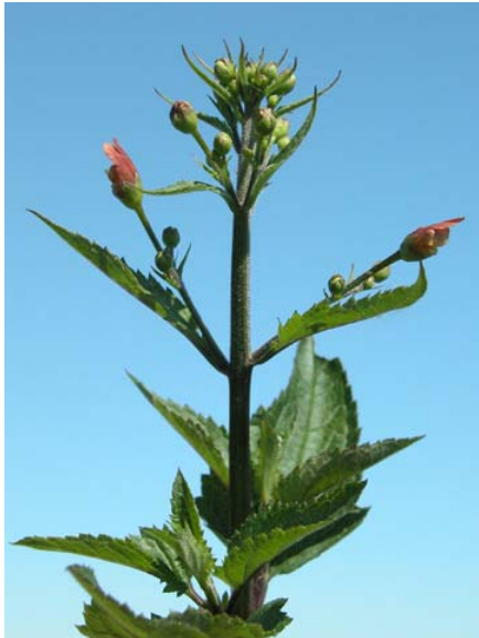
California Figwort Scrophularia californica ssp. californica Native Perennial Snapdragon Family