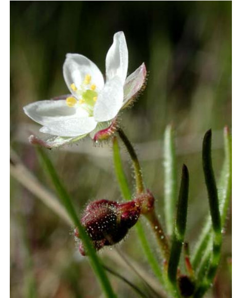
Stickwort Spargula arvensis ssp. arvensis Introduced Annual Pink Family