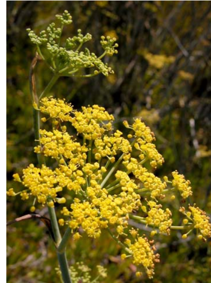
Sweet Fennel Foeniculum vulgare Introduced Perennial Carrot Family