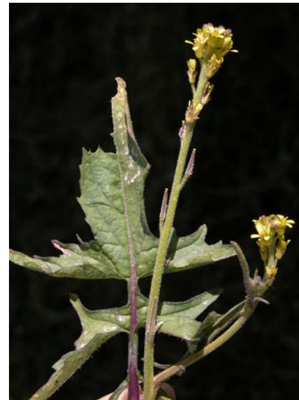
Black Mustard Brassica nigra Introduced Annual Mustard Family