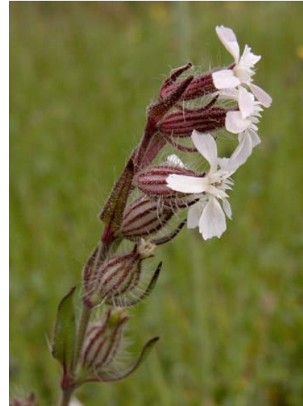
Windmill Pink Silene gallica Introduced Annual Pink Family