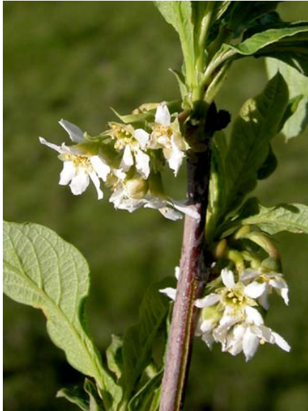
Oso Berry Oemleria cerasiformis Native Perennial Rose Family