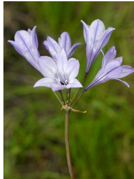
Ithuriel's Spear Triteleia laxa Native Perennial Lily Family