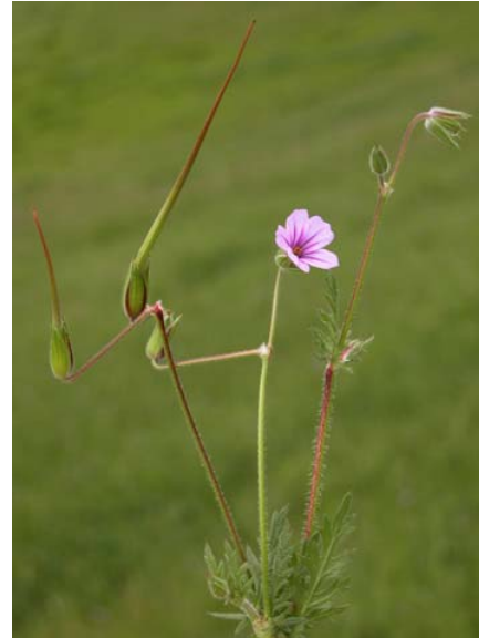
Long-beaked Filaree Erodium botrys Introduced Annual Geranium Family