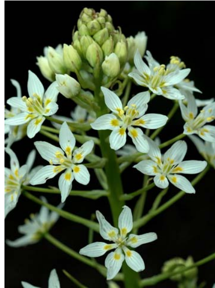
Common Star Lily Zigadenus fremontii Native Perennial Lily Family