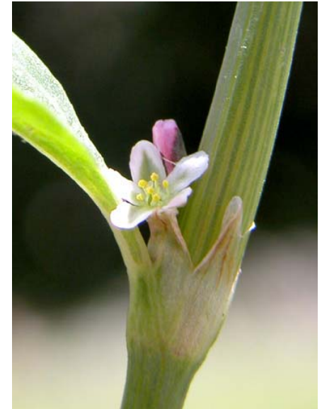
Common Yard Knotweed Polygonum arenastrum Introduced Annual Buckwheat Family