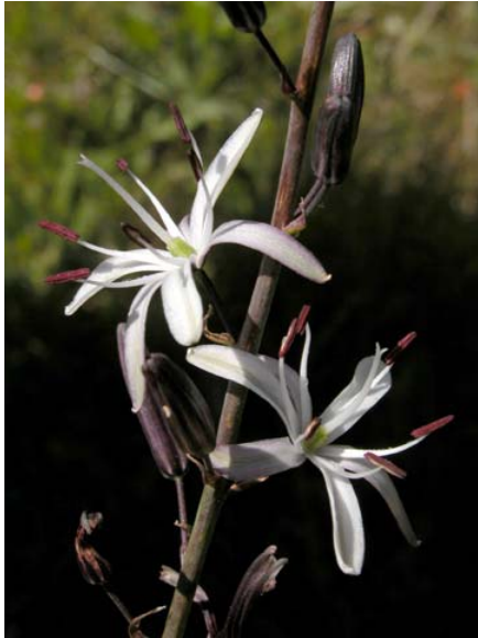
Common Soap Plant Chlorogalum pomeridianum var. pomeridianum Native Perennial Lily Family