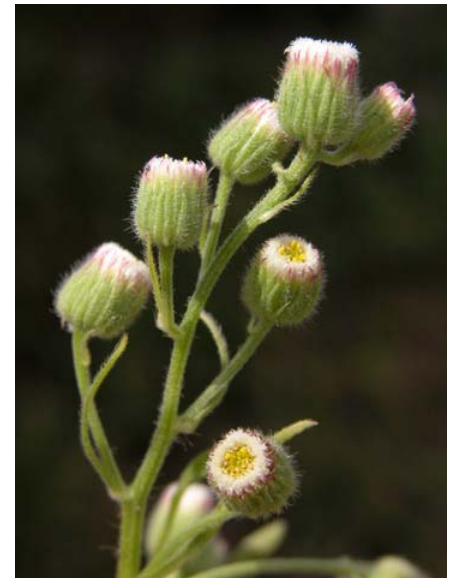
South American Horseweed Conyza bonariensis Introduced Annual Sunflower Family