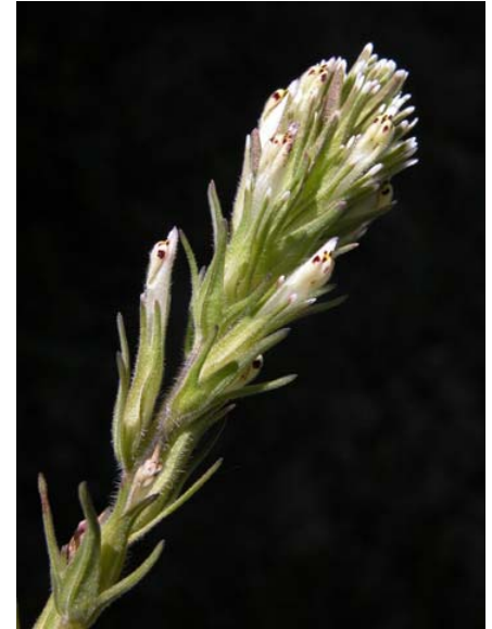
Valley Tassels Castilleja attenuata Native Annual Snapdragon Family