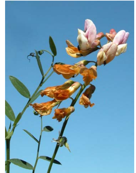
Pale Purple Pacific Pea Lathyrus vestitus var. vestitus Native Perennial Pea Family