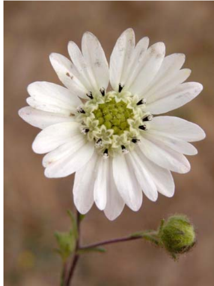
Hayfield Tarweed Hemizonia congesta ssp. luzulaefolia Native Perennial Sunflower Family