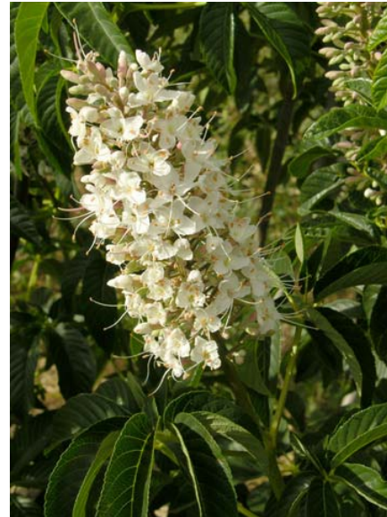
California Buckeye Aesculus californica Native Perennial Buckeye Family