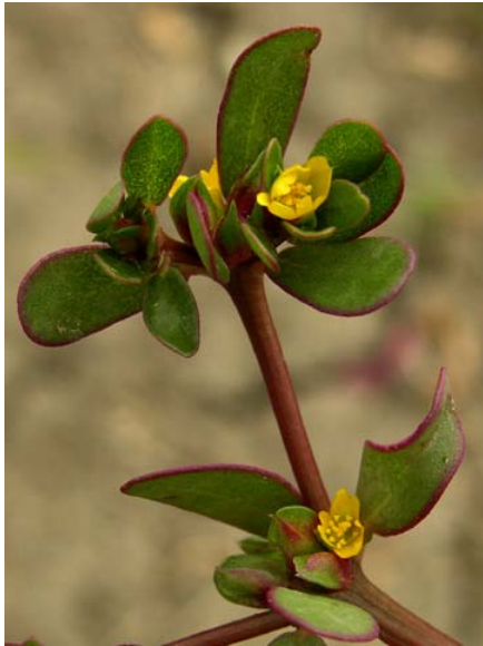
Common Purslane Portulaca oleracea Introduced Perennial Purslane Family