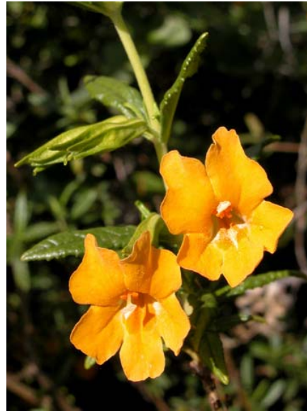
Bush Monkey Flower Mimulus aurantiacus Native Perennial Snapdragon Family