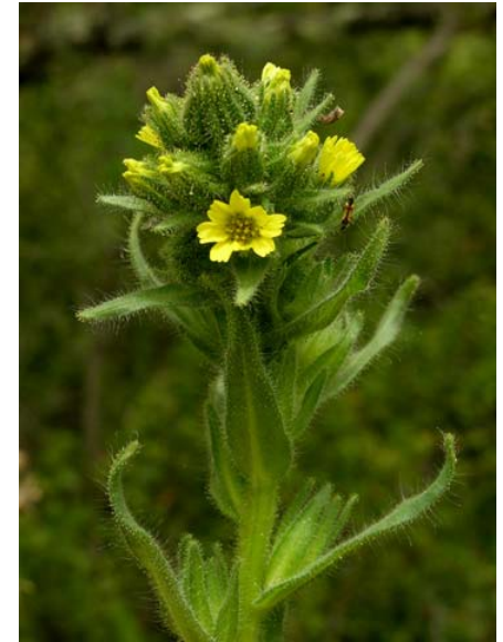
Common / Coast Tarweed Madia sativa Native Annual Sunflower Family