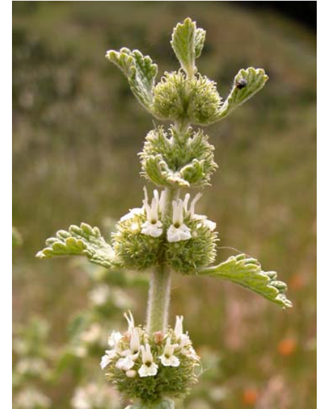
Common Horehound Marrubium vulgare Introduced Perennial Mint Family