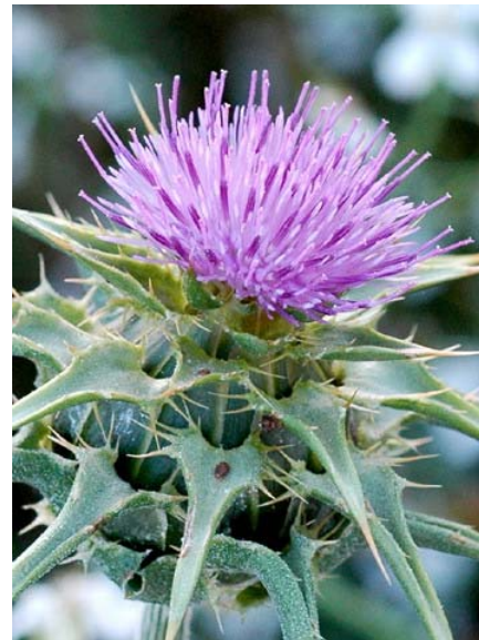
Milk Thistle Silybum marianum Introduced Annual-Biennial Sunflower Family