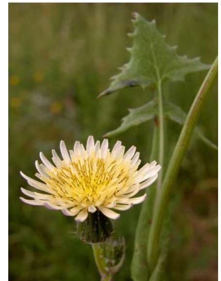
Common Sow Thistle Sonchus oleraceus Introduced Annual Sunflower Family