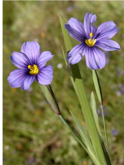
Blue-eyed Grass Sisyrinchium bellum Native Perennial Iris Family