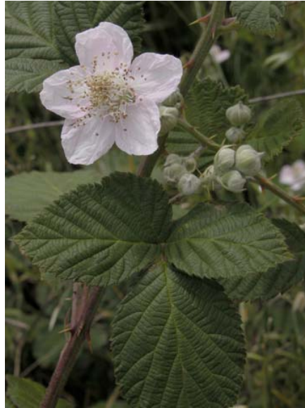
Himalayan Blackberry Rubus discolor Introduced Perennial Rose Family