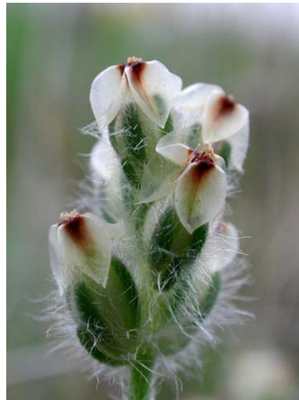
California Dwarf Plantain Plantago erecta Native Annual Plantain Family