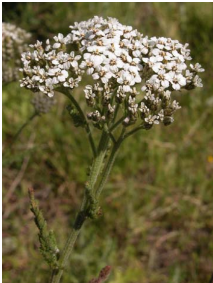
Yarrow Achillea millefolium Native Perennial Sunflower Family