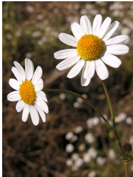
Mayweed Anthemis cotula Introduced Annual Sunflower Family