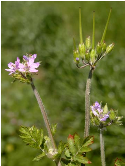
White-stem Filaree Erodium moschatum Introduced Annual Geranium Family