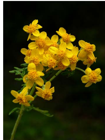
Golden Yarrow Eriophyllum confertiflorum var. confertiflorum Native Perennial Sunflower Family