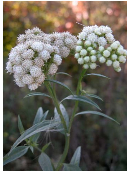
Douglas/Salt Marsh Baccharis Baccharis douglasii Native Perennial Sunflower Family