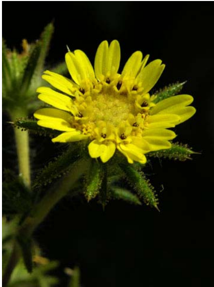
Fitch Spikeweed Hemizonia fitchii Native Perennial Sunflower Family