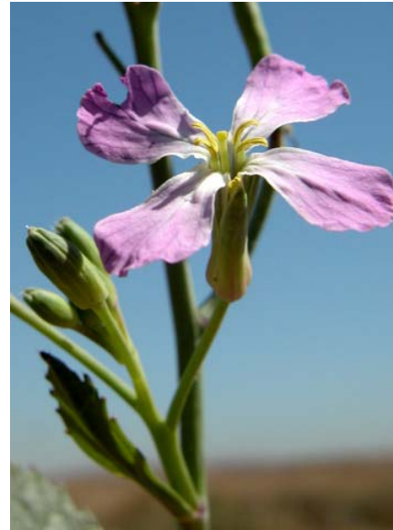
Wild Radish Raphanus sativus Introduced Annual Mustard Family