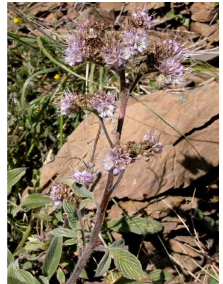
California / Rock Phacelia Phacelia californica Native Perennial Waterleaf Family