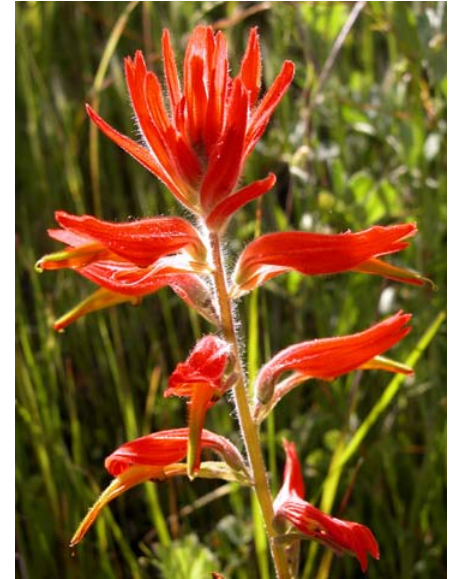
Common Indian Paintbrush Castilleja affinis ssp. affinis Native Perennial Snapdragon Family