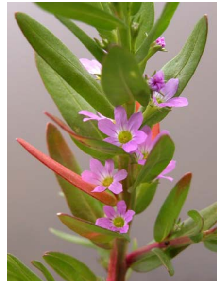
Grass Poly Loosetrife Lythrum hyssopifolium Introduced Annual-Perennial Loosetrife Family