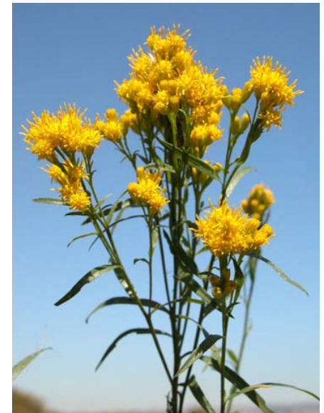
Western Goldenrod Euthamia occidentalis Native Perennial Sunflower Family