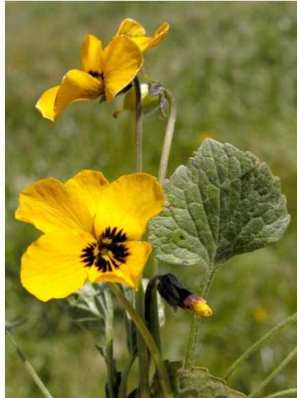
Johnny-Jump-Up / Wild Pansy Viola pedunculata Native Perennial Violet Family