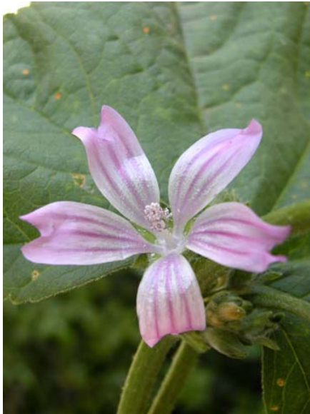
Bull Mallow Malva nicaeensis Introduced Annual Mallow Family