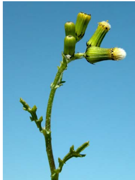
Common Groundsel Senecio vulgaris Introduced Annual Sunflower Family