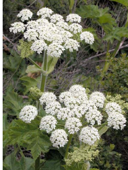
Cow Parsnip Heracleum lanatum Native Perennial Carrot Family