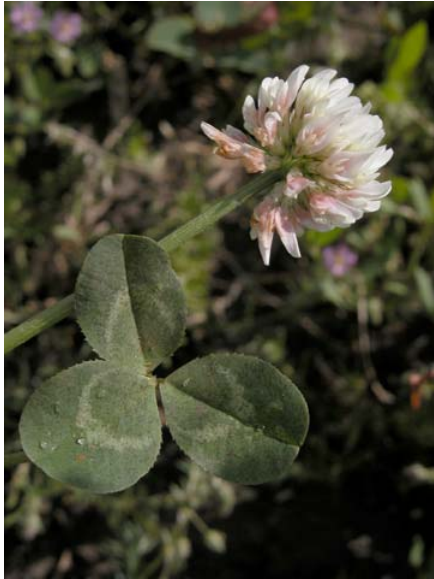
White Clover Trifolium repens Introduced Perennial Pea Family