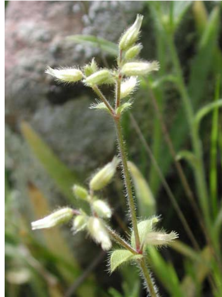
Mouse-ear Chickweed Cerastium glomeratum Introduced Annual Pink Family