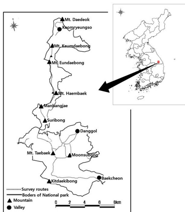
Fig. 1. The position of Taebaeksan Mountains within Korean Peninsula and the surveyed routes in this study.

name, substrates, and habitats were recorded in the field. The collected materials were air-dried in the laboratory, and some species were cultivated in the greenhouse. All specimens were deposited in the Jeonbuk National University Herbarium (JNU) and in National Institute of Biological Resources Herbarium (KB).