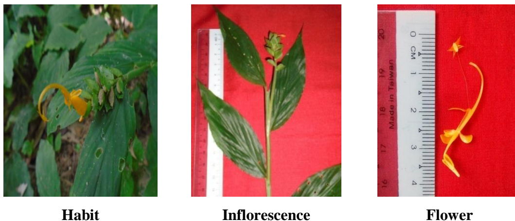
Figure (5) Morphology of Globba marantina L.