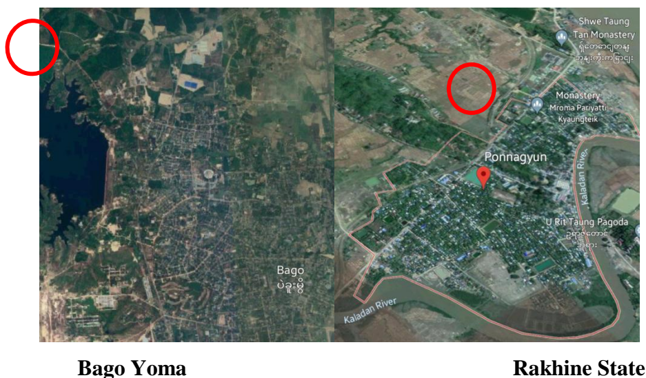
Figure (1) Maps of study areas