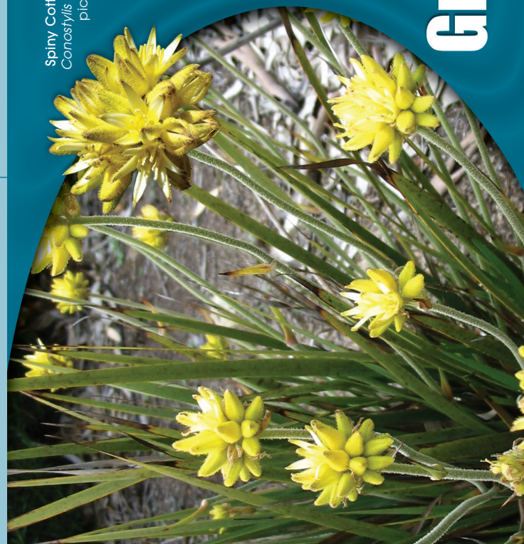
Spiny Cottonheads Conostylis aculeata pictured left