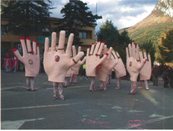
Figure 7. Carnival, Giffoni.

The long walk down to Giffoni Valle Piana ended in surreal fashion as the town carnival was in full swing, and we picked our way through the procession of floats, troupes of participants, many in costumes and masks, and the spectators lining the road. The more memorably disturbing participants included a group of giant hands (Figure 7), a float laden with giant syringes and cigarettes followed by an ambulance, and a man in a nun's costume that opened to reveal a priapic red devil.