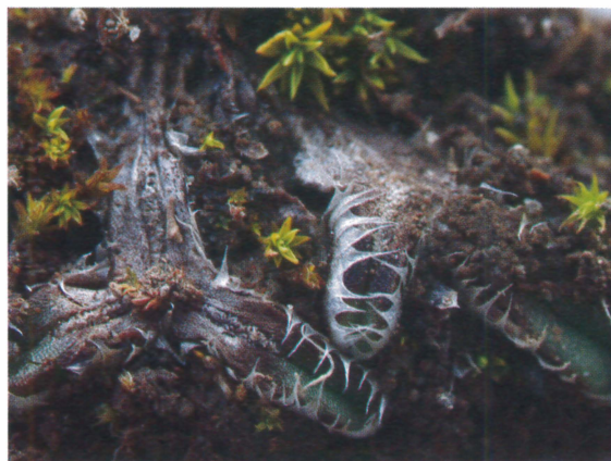
Figure 4. Oxymitra incrassata , Positano.

We saw superb material of Mannia androgyna on the walls and banks and were able to confirm its androgynous nature. On the rock outcrops the highlights were Crossidium squamiferum var. squamiferum and a patch of Oxymitra incrassata , the latter with hyaline scales curling over the thalli like the teeth of a man-trap (Figure 4). Other species of open rocks and shallow soil included Fossombronia echinata , Didymodon sicculus , Fissidens ovatifolius , Grimmia orbicularis , Gymnostomum calcareum and G. viridulum . Sam’s scrutiny of the Schistidia produced S. elegantulum and S. singarense , as well as S. crassipilum , while the Grimmia species included G. dissimulata , G. lisae and G. tergestina . Eurhynchium meridionale was seen rather locally in shaded places, and Cololejeunea rossettiana in one shaded gully. The patches of