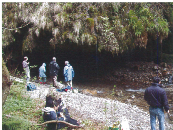
Figure 2. Cyatodium site, Valle delle Ferriere.

In all we recorded 73 mosses and 26 liverworts in the gorge, a highly respectable total for a lowland site in the Mediterranean area.