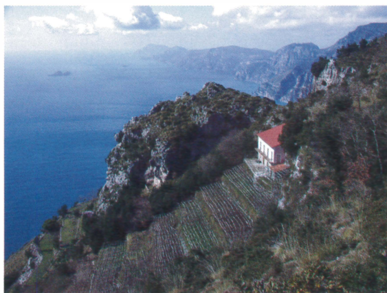
Figure 3. View of Positano.

tell, the sweet chestnut coppice was species-poor but Jeff quickly located Campylostelium saxicola on loose stones. Massive boulders in the woods supported Antitrichia curtispindula , Grimmia lisae and G. meridionalis , with much Pterogonium gracile and a robust form of Isothecium myosuroides , found by Sam. Roadside and streamside banks on the descent to Fontana also looked as if they might be interesting: brief stops produced Scapania compacta , Tortula cuneifolia and a second, curious Tortula , perhaps a form of T. solmsii . Dripping with rain, we boarded another bus to the port and caught a return ferry to Naples. It is a pity that the visit to the island was blighted by bad weather, especially as it took place on the birthday of one of our party, Ron Porley.