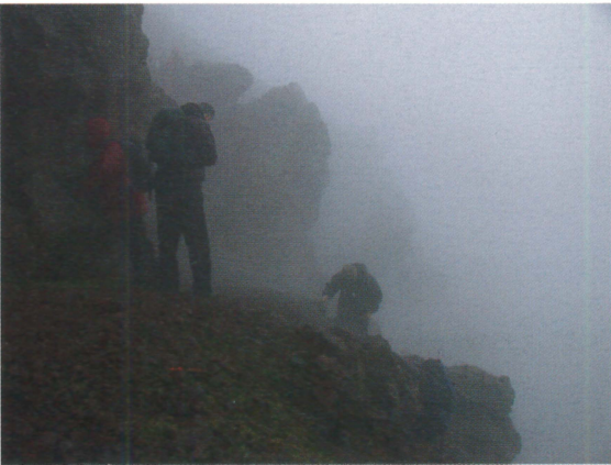
Figure 5. Cloud and rain on Vesuvius.

We had expected that this day, set aside for our visit to Vesuvius , would provide one of the highlights of the week. The morning was gloomy and as the forecast suggested that conditions would deteriorate, Roberto suggested that we start on the highest ground. On reaching the car park below the summit, at 1,010 m, we found that conditions were so unpleasant that it was only after prolonged discussion that Roberto persuaded the guides to take us round the high ground. As we waited for the result of the negotiations, we watched rain and, on occasion, snow showers swirling round the crater (Figure 5). It was difficult to distinguish the volcanic smoke emerging from fumaroles from the prevailing low cloud and mist.