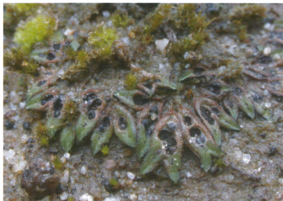
Figure 1. Riccia nigrella , Cilento.

We had all been given ‘buffalo eggs’ to carry for our lunch, and on reaching a local vineyard these succulent balls of mozzarella, some smoked, formed the basis of a buffet meal with bread, delicious ricotta and the excellent local white wine. Thus fortified, we returned by a slightly different route, which initially took us close to the shore. In a clearing in the scrub, on flat rather silt-like soil near the top of the low coastal cliff, we found a mixed population of Riccia bicarinata , R. nigrella (Figure 1) and R. subbifurca together with the tiny ephemerals Acaulon muticum , Aschisma carniolicum , Ephemerum sessile and E. serratum var. serratum .