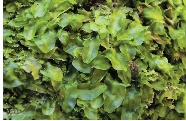
△Fig. 8. Pallavicinia lyellii . M. Lüth