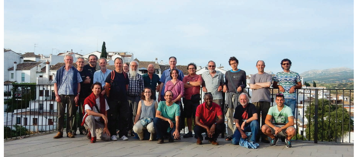
△Fig. 15, above. Group photo at Ronda. E. Sulmont.