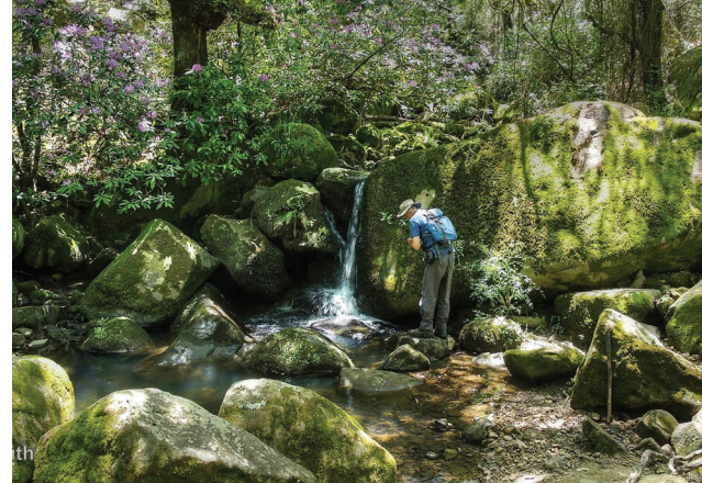
△Fig. 12, left. A tall Quercus suber forest at La Saucedá, Los Alcornocales N.P. B. Vigalondo. Fig. 13, right. La Saucedá, Los Alcornocales N.P., stream with autochthonous Rhododendron . Tom Blockeel discovering Homalia lusitanica . M. Lüth

path to the Aljibe peak surveying the stream uphill to reach an interesting area of “Canuto” vegetation formations, dominated by natural and autochthonous Rhododendron ponticum that welcomed us at lunchtime with a beautiful pink blossom (Fig. 13). Along the way up, we could examine a good population of Asterella africana , a thallose liverwort not previously known from Southern Iberian Peninsula. Other remarkable species located were the hornworts Phymatoceros bulbiculosus and Phaeoceros laevis , the liverwort Corsinia coriandrina (Fig. 14), and the mosses Dialytrichia mucronata , Fabronia pusilla , Homalia lusitanica , Orthotrichum comosum , Scorpiurium sendtneri and Tortula freibergii .