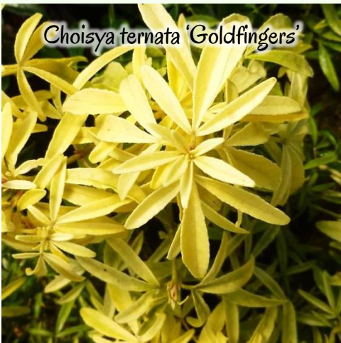
Choisya ternata 'Goldfingers'

Native to southwestern North America and Mexico, Choisya, or Mexican Orange, is known for its abundance of fragrant, star-like flowers. This aromatic evergreen impresses planted en masse or as a border shrub, and makes a superb container specimen. Deer resistant, drought tolerant, and attracts hummingbirds, bees and butterflies.