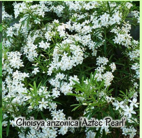
Choisya arizonica 'Aztec Pearl'

▲ Finely textured foliage is glossy, golden yellow year round. Extremely fragrant, citrusy, showy white flowers in Spring. 3-5'H x 3-5'W; USDA 8-10; full sun; dryer, well-drained soil.