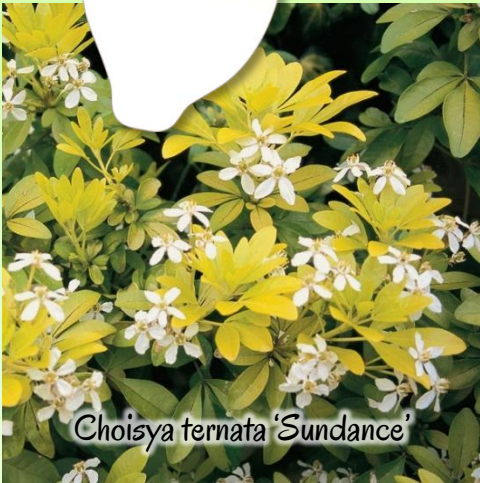
Choisya ternata 'Sundance'

Briggs Nursery carries a great selection of Choisya, including perennial favorites 'Sundance' and 'Aztec Pearl', plus three exciting new cultivars, 'Goldfingers', 'Bluestone' and 'Goldstone'. Call for available sizes and pricing.