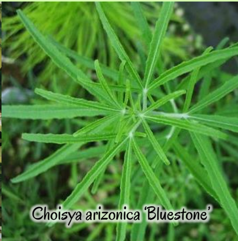
Choisya arizonica 'Bluestone'