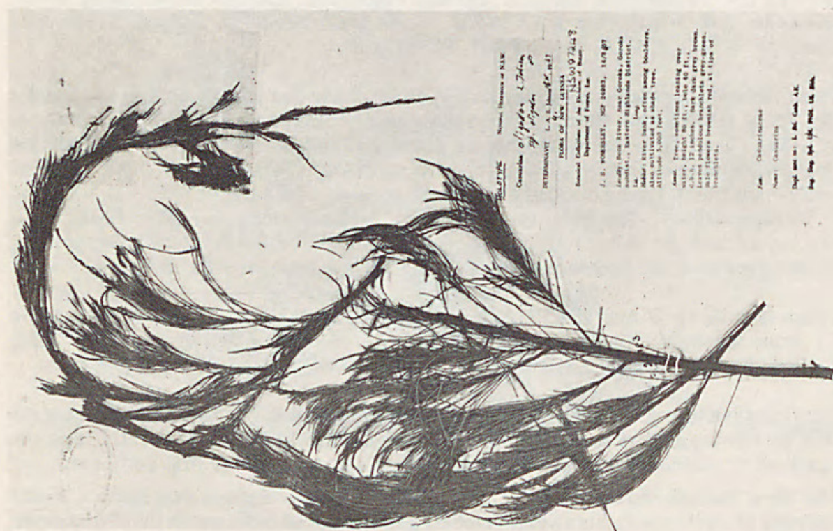
Fig. 3. Holotype of C. oligodon L. Johnson (Womersley NGF 24983: NSW).