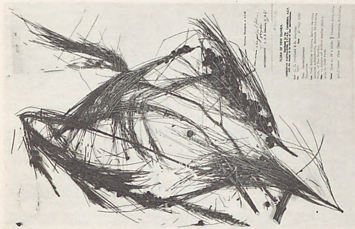
Fig. 4. Representative female specimen of C. oligodon ssp. oligodon .