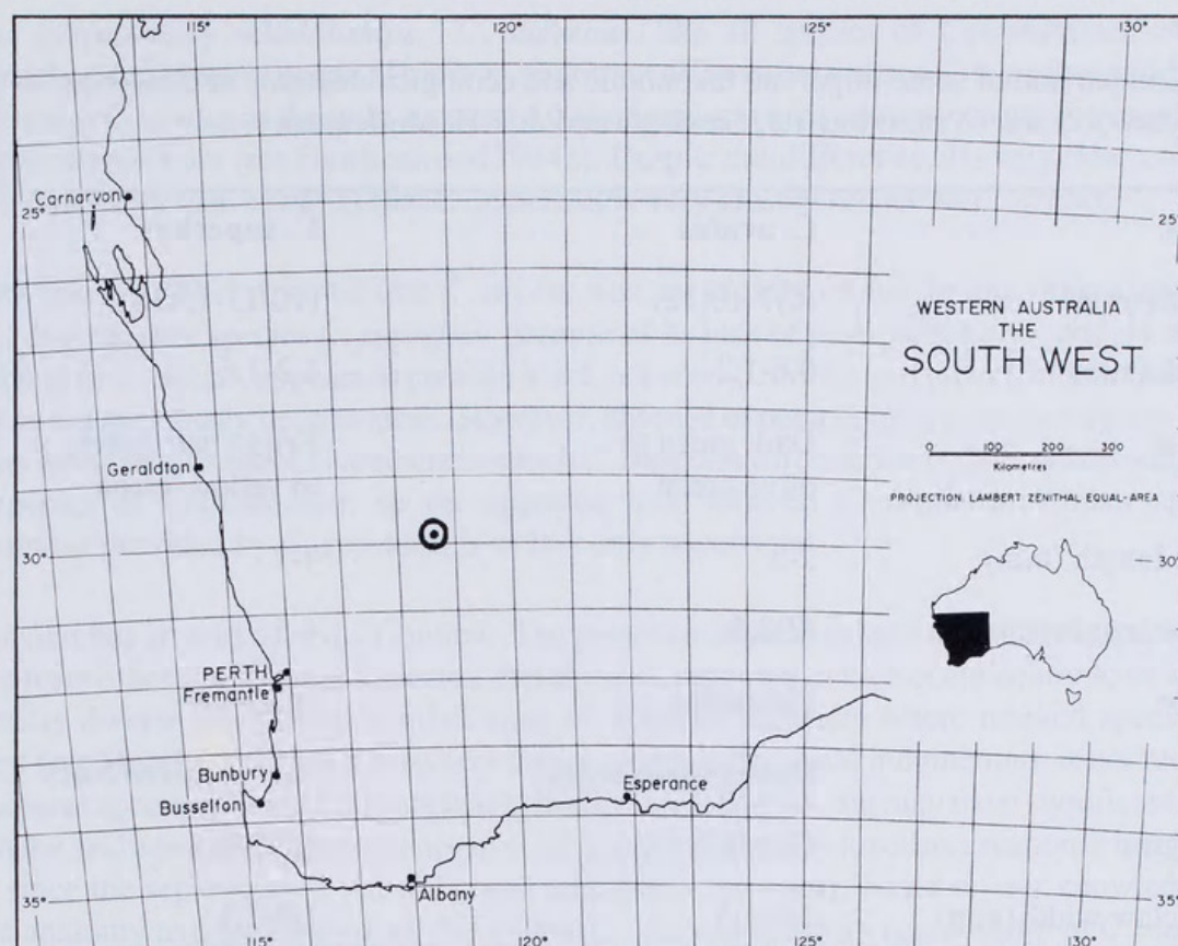
Figure 4. Distribution of C. superbis T.J. Hawkeswood & F.H. Mollemans.

and serious threat especially considering the small size of known C. superbis populations, viz. only about 25 plants were counted by Mollemans at the first site (Mollemans 3812) and about 18 at the other site (Mollemans 3813). The degree of susceptibility of C. superbis to fires is not known and perhaps fires and their effects should be closely monitored in the future.