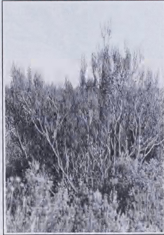
Figure 2. Habit of Calothamnus superbus T.J. Hawkeswood & F.H. Mollemans in mixed shrubland and heath near Pigeon Rocks.

Typus : Track from Emu Fence, east towards Pigeon Rocks Tank & west of Clampton Mineral Prospect (precise locality withheld), alt. c. 510 m; abundance uncommon; 11 July 1990, F.H. & M.P. Mollemans 3078 (holo: PERTH). (Figure 1)