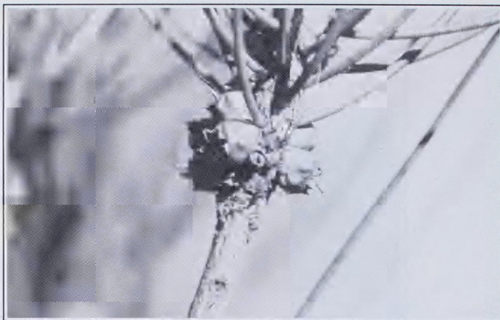
Figure 3. Close-up of a branch of Calothamnus superbus T.J. Hawkeswood & F.H. Mollemans in mixed shrubland and heath near Pigeon Rocks showing a cluster of young fruiting capsules.

Other specimens examined. WESTERN AUSTRALIA: Pigeon Rocks (Clamptons Vermin Fence track, east of vermin fence), 12 July 1991, F.H. Mollemans 3812 (PERTH); Pigeon Rocks (Clamptons Vermin Fence track, east of vermin fence), 13 July 1991, F.H. Mollemans 3813 (PERTH).