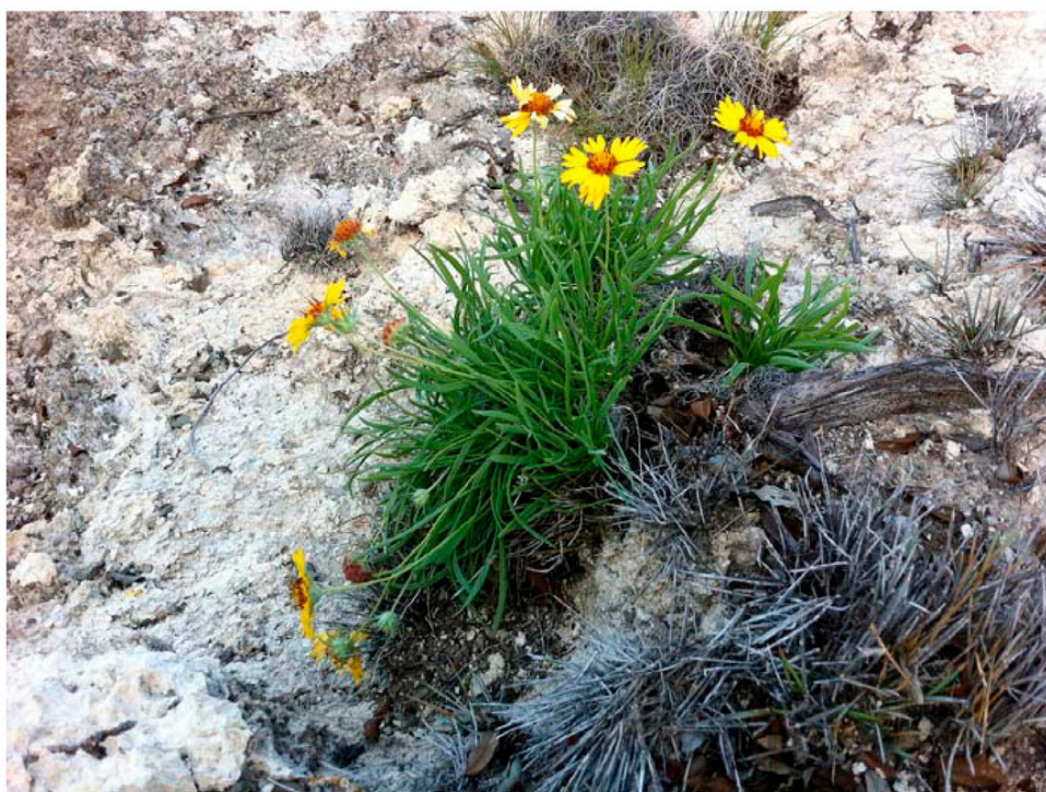
Fig. 3. Gaillardia c. mikemoorei in the field.