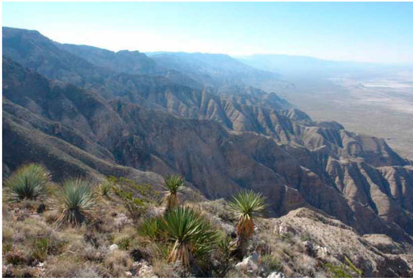
Fig. 4. Type locality of G. c. mikemoorei .