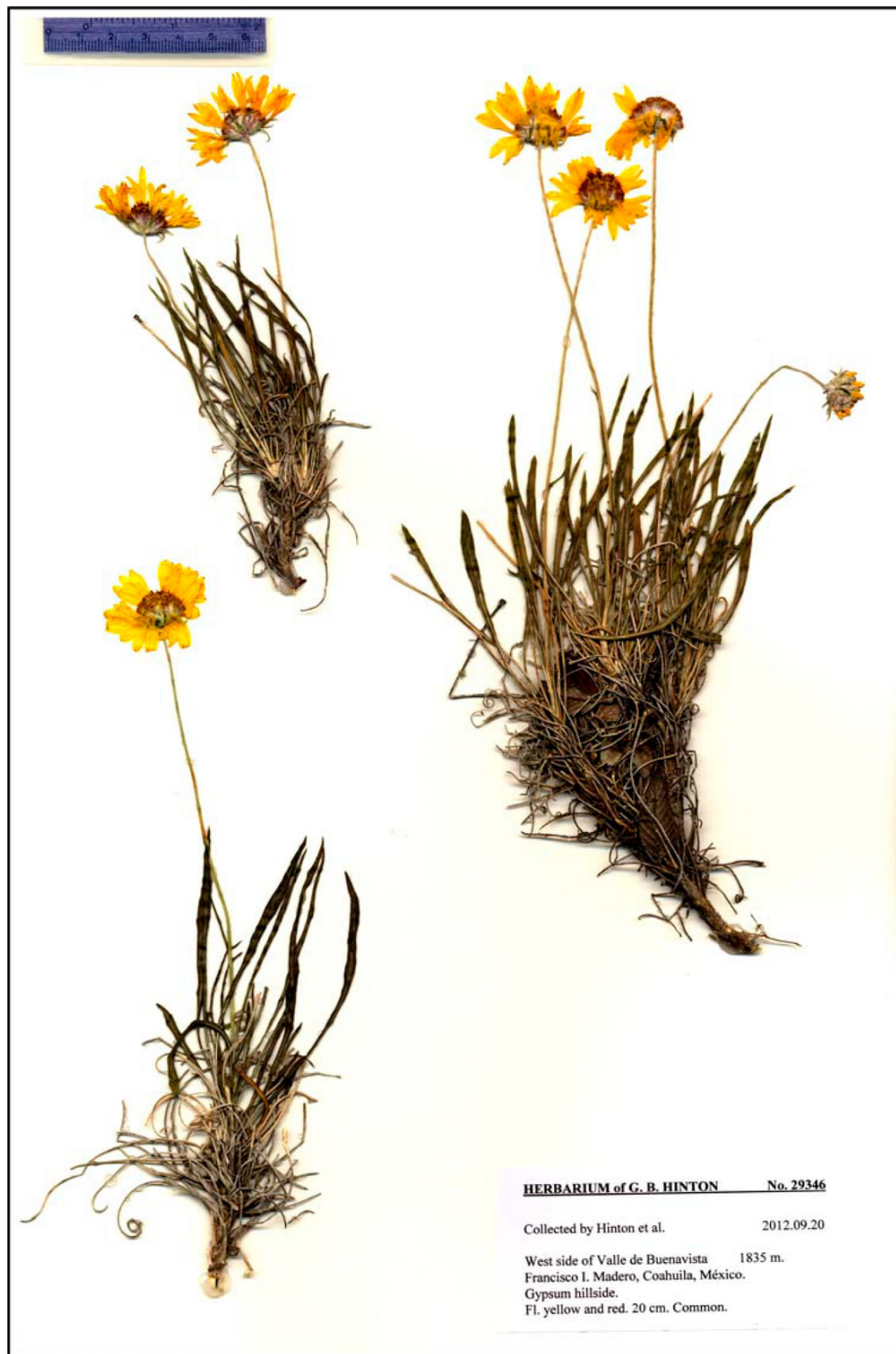
Fig. 1. Gaillardia c. var. mikemoorei (Holotype: MEXU; isotypes: GBH, TEX).