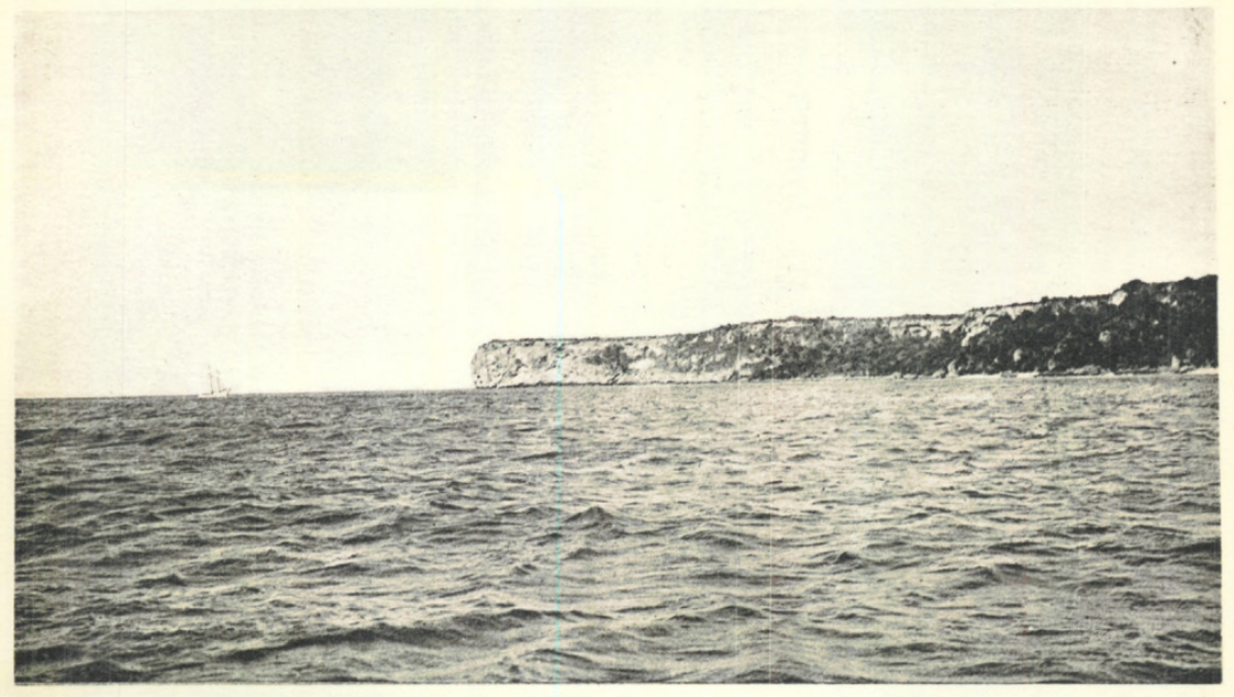
Fig. 2 BRITTON—VEGETATION OF MONA ISLAND