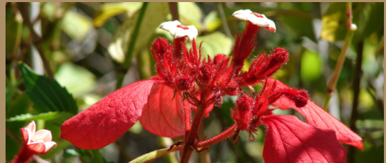
Ashanti blood (Mussaenda erythrophylla)