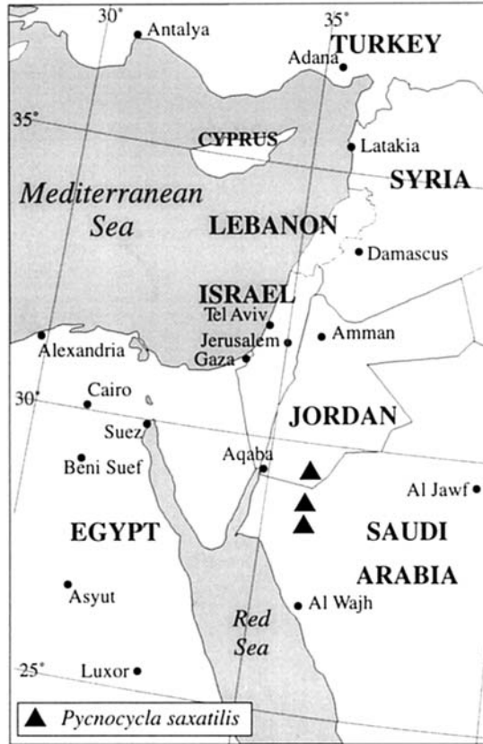
Fig. 2. Distribution of Pycnocycla saxatilis Danin, Hedge & Lamond.

mentose. Sepals 0.5 mm long, acicular, \pm conspicuous; in fruit 1-1.8 mm long. Petals white or white-rose, marginal not or slightly radiant. Mericarps oblong-cylindrical, curved, densely tomentose, only one mericarp develops (Fig. 1i); styles c. 5 mm. Fl. 6(?)–11.