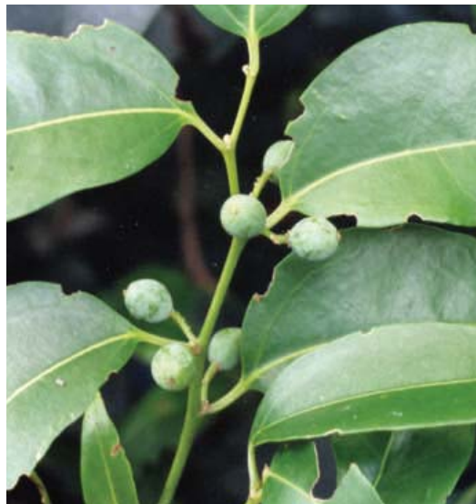
Celtis paniculata (Fruit and leaves)