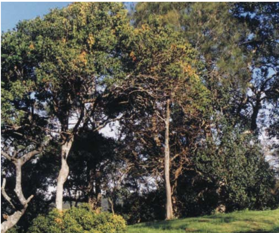
A number of rare trees grow in this small isolated pocket of the littoral rainforest at the Lilli Pilli Point Reserve.

In recent years the efforts of Bushcare volunteers backed by local Councils have done much to save what bushland remains and to return