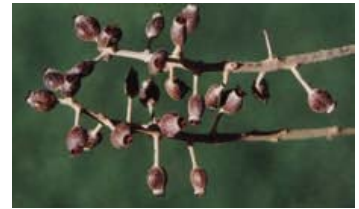
Polyscias elegans - Celery Wood or Silver Basswood