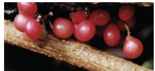
Sarcopetalum harveyanum , Pearl Vine (Male flowers and fruit)