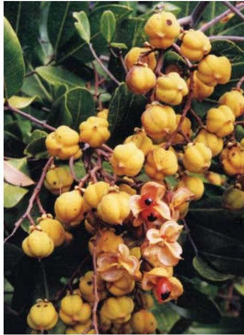
Cupaniopsis anarcardioides , Tuckeroo (Flowers, fruit and seeds)