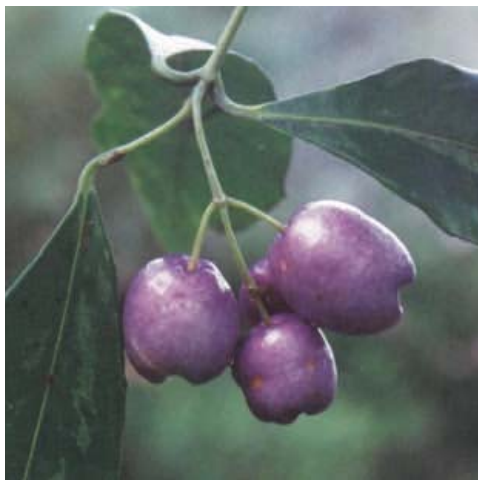
Syzygium oleosum , Blue Lilly Pilly or Blue Cherry (Flowers and fruit)