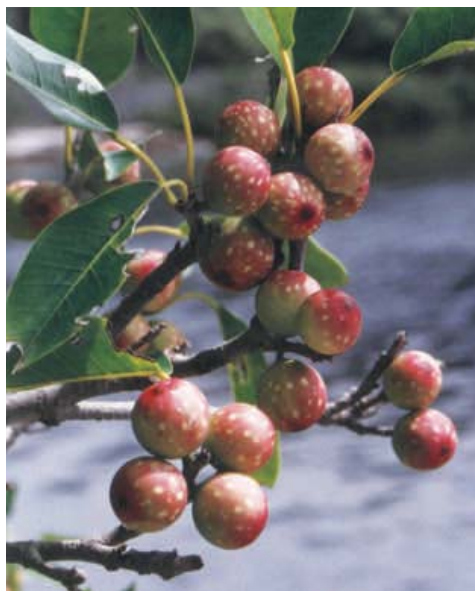
Ficus superba var henneana , Deciduous Fig (Fruit)