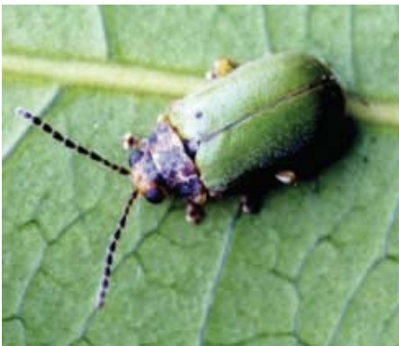
The Menippus fugitivus beetle.

The 5mm long Menippus fugitivus is a small light green chrysomelid beetle. At the present time very little is known about the life cycle of this beetle other than that the female adults lay eggs in spring, which hatch into small larvae.