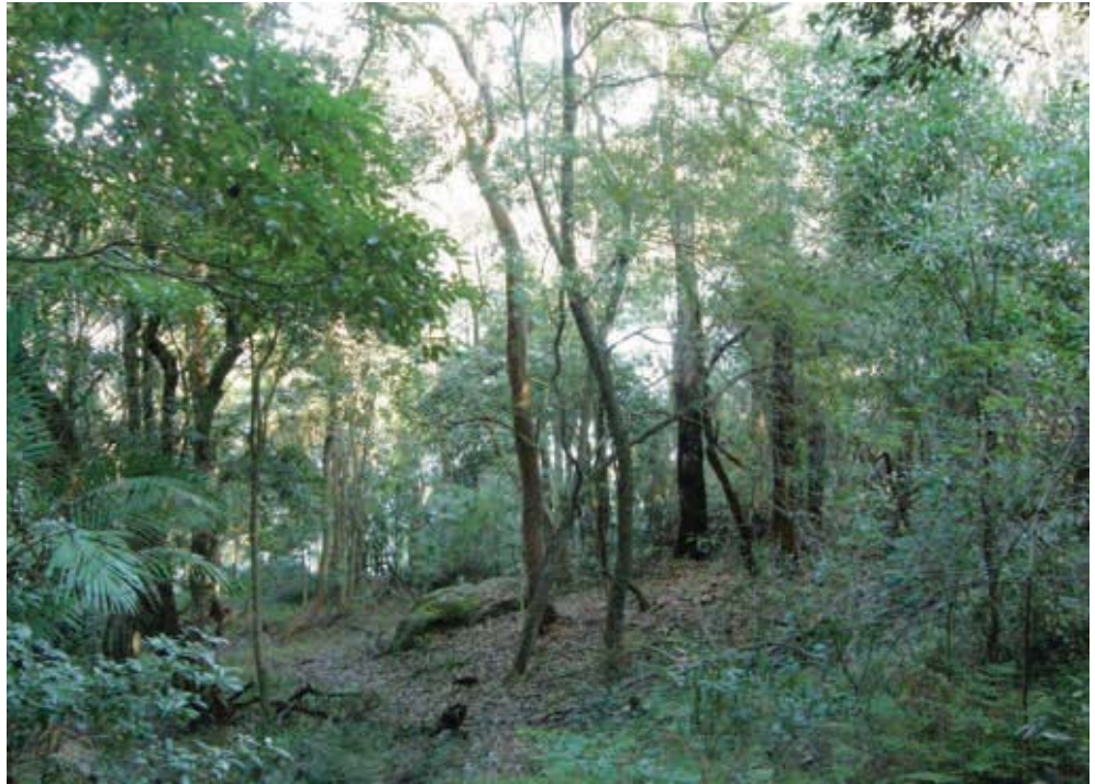
Littoral Rainforest at Lilli Pilli Point Reserve