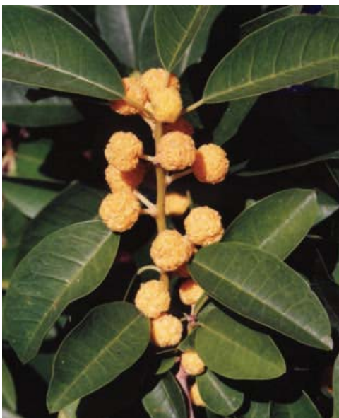
Maclura cochinchinensis , Cockspur Thorn (Flowers)