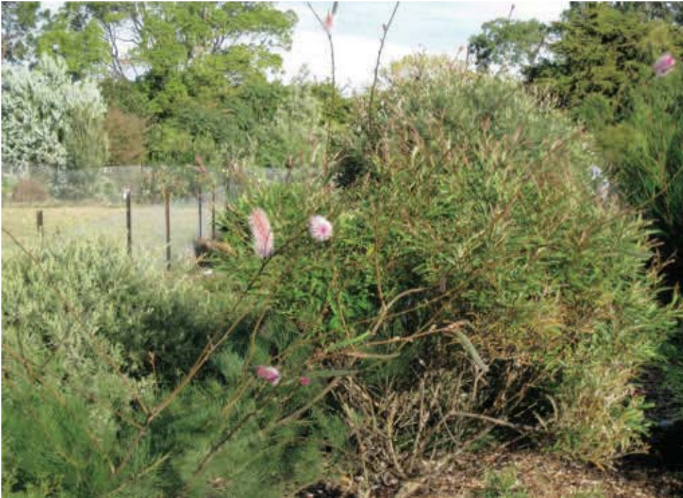
A mixed bed of grevilleas, three to four years after planting.