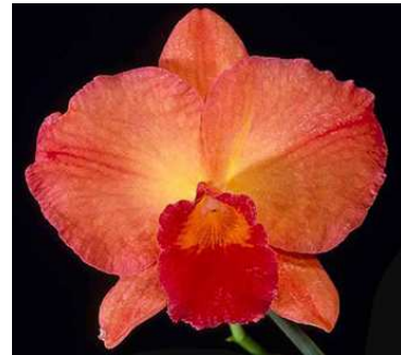
Cattleya Circle of Life (hybrid)