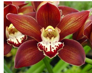
Cymbidium Voodoo 'Halloween'