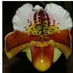
Paphiopedilum Small World

A hybrid made up of two species is referred to as a primary hybrid. A hybrid made up two hybrids or a hybrid and a species is referred to as a complex hybrid. For example, Dendrobium Red Emperor is a complex hybrid of two hybrids: Dendrobium Benikujyaku and Dendrobium New Comet . This cross can also be written as Dendrobium Benikujyaku x Dendrobium New Comet or as Dendrobium (Benikujyaku x New Comet).