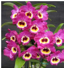
Dendrobium Red Emperor 'Prince'

Dendrobium Red Emperor has a well-known cultivar, 'Prince'. Another example is Cymbidium Voodoo 'Halloween'. Note that no comma appears between the species or hybrid name and the cultivar name.