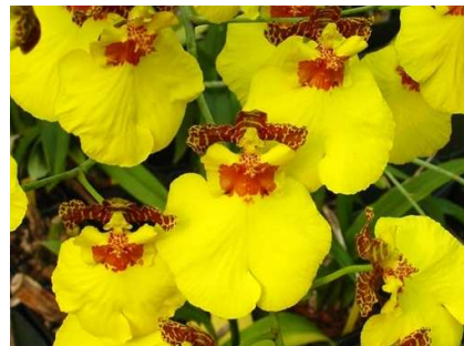
Onc. Palmyra 'Golden Girl', AM/AOS