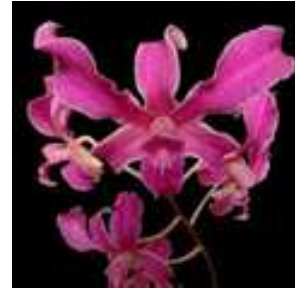
Dendrobium x superbiens