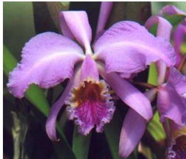
Cattleya mossiae (species)