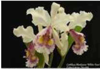
Cattleya x hardyana