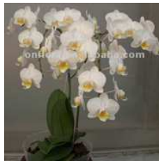
Phalaenopsis MINI DEER

An example is Phalaenopsis MINI DEER. The proper way to write trade names is to italicize the genus name and to place the trade name in all caps with no quotation marks. The first letter of each word in the trade name should have a slightly larger font than the remaining capital letters. While these plants can be judged for ribbon awards at an AOS-sanctioned show, they cannot be judged for AOS awards because the parents cannot be identified.