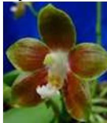
Phalaenopsis venosa Shim & Fowlie

In some orchid articles, the person's name who described the genus or species will also be included as part of the orchid's name. For example, Phalaenopsis venosa Shim & Fowlie indicates that Phyu Soon Shim and Jack Fowlie described this well-known species.