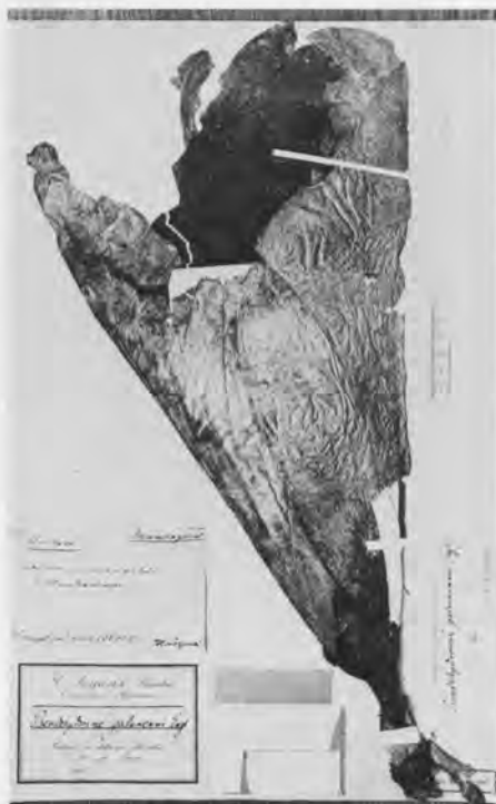
Figure 1: Pseudohydrosme gabunensis Engl. Holotype Soyaux 299 (B). The name on the left and right label is in Engler's handwriting.

When I saw the flowering P. gabunensis , it was clear to me that the genus Pseudohydrosme is very closely related to Anchomanes Schott, which has a long peduncled inflorescence and an unilocular ovary. P. gabunensis has a bilocular ovary and a very short peduncle