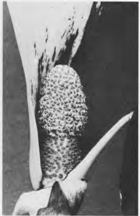
Figure 9: Pseudohydrosme gabunensis Engl. Spadix, spathe partly opened (Bogner 664).

middle septum and ascending; ovule anatropous, ellipsoid, ca. 0.7 mm long and ca. 0.4 mm in diameter, funiculus ca. 0.5 mm long; style short, 1-1.5 mm long and ca. 1.5 mm in diameter, of the same color as the ovary; stigma bilobed, seldom trilobed, papillose, depressed in the center, ca. 2 mm in diameter, reddish brown to purple. Stamens free, ca. 4 mm high and rectangular in cross section, ca. 1.8 (2) x 1.2 mm, slightly angled, yellowish and at its top purple; thecae oblong, ca. 3 mm long and opening by an apical pore; connective capitate and rising above the thecae; pollen yellow and exuded in strings, pollen grain ellipsoid, inaperturate, 100-120 \mu x 70-100 \mu , exine slightly scabrous. Fruits unknown.