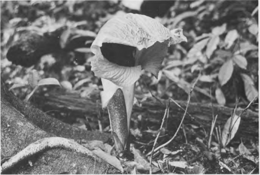
Figure 7: Pseudohydrosme gabunensis Engl. Inflorescence during anthesis in its natural habitat near Libreville, Station for stier Sibang (Bogner 664).