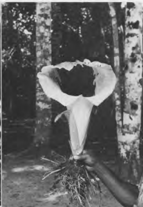
Figure 5: Pseudohydrosme gabunensis Engl. Inflorescence before anthesis in its natural habitat near Libreville, Station forêstier Sibang (Bogner 665).