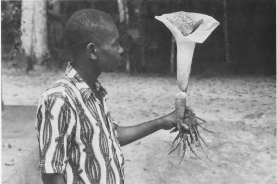
Figure 8: Pseudohydrosme gabunensis Engl. Flowering specimen after anthesis (Bogner 664.)