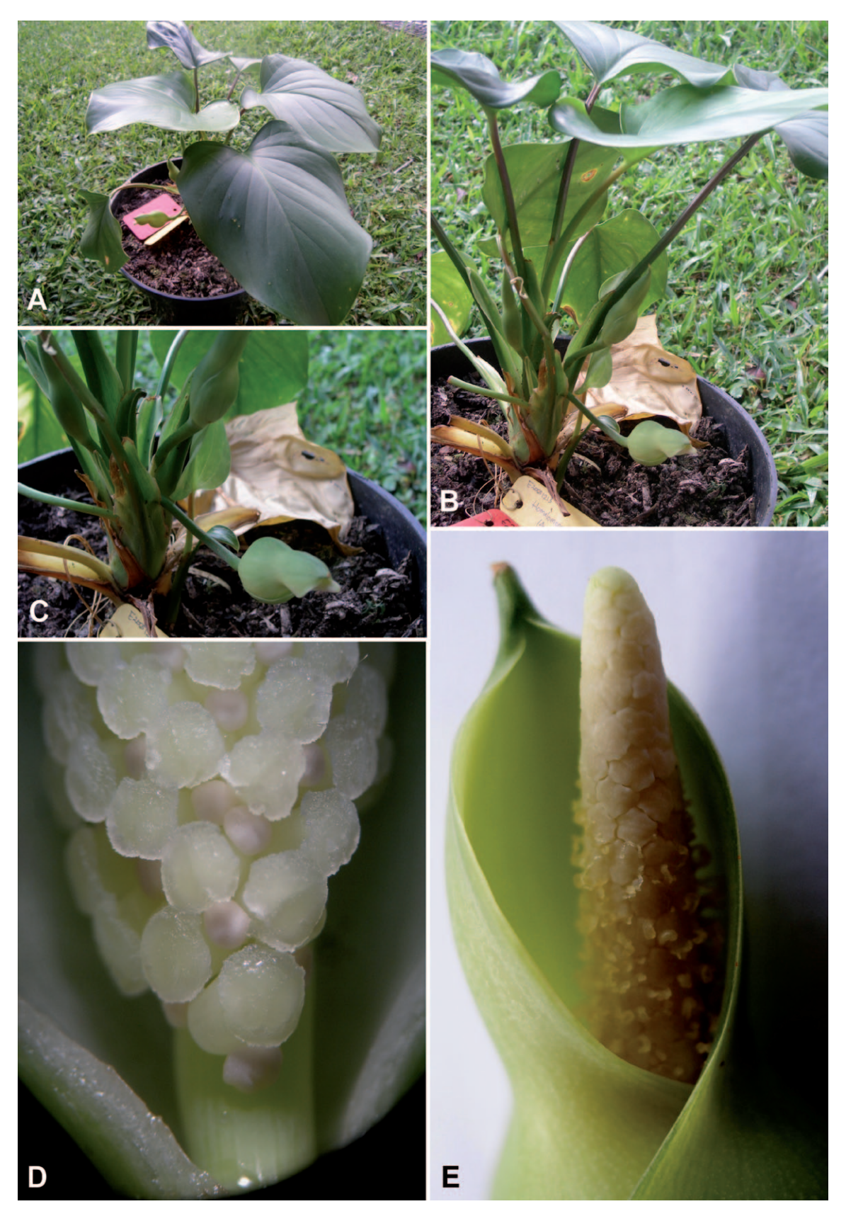
Fig. 1. Homalomena tirtae – A–C: habit of the plant in cultivation in the Bali Botanic Garden, source of the holotype; note the green spathe, open petiolar sheath and the brownish staining of the petiole; D: detail of pistillate flower zone at pistillate anthesis, showing the pistils exceeding the interpistillar staminodes and the 3-lobed stigmas; E: inflorescence at late staminate anthesis; note that the terminal portion of the spadix is composed of sterile staminate flowers (no pollen strings released). from I Gede Tirta GT.2105 cultivated as accession E20051213 in the Bali Botanic Garden.